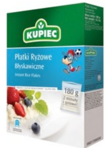
8187. Rice flakes 180g (12)