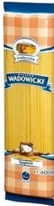
16458. Spaghetti 400g (20)