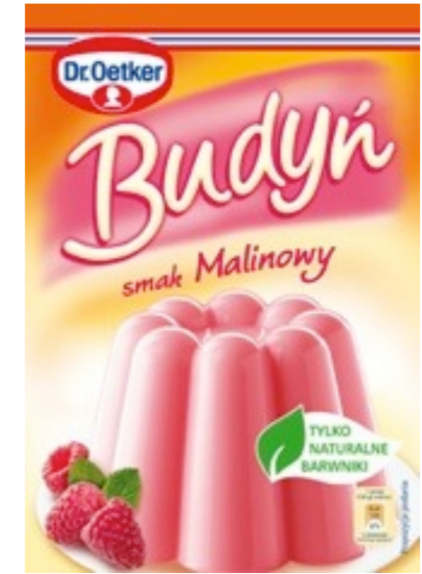
4703. Raspberry 40g (30)