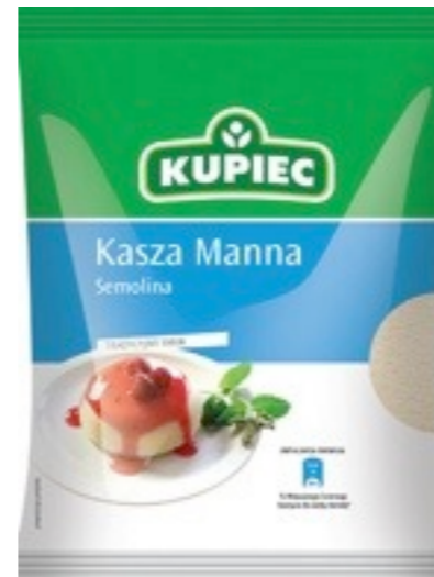
1528. Semolina 400g