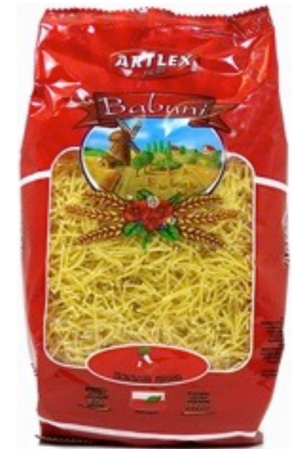
11529. Nitka 400g (18)