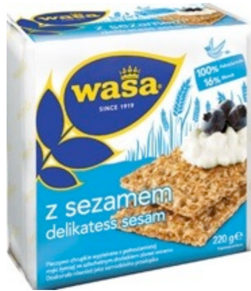
2395. Sesame 220g (12)