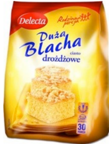
13593. Drożdżowe 600g (5)