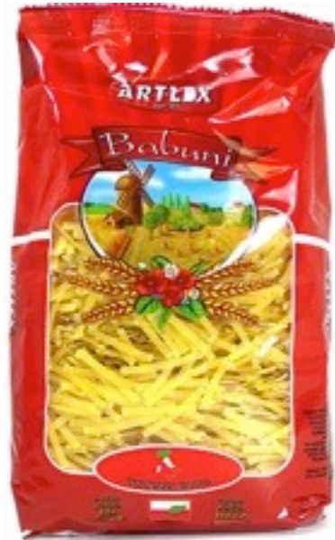
11531. Wstążka 400g (18)