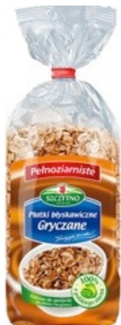
14978. Buckwheat 400g