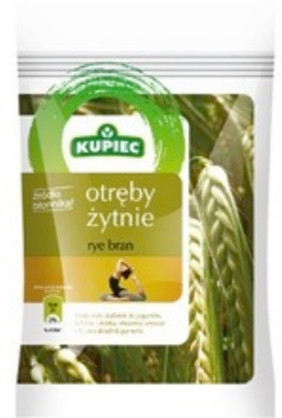
15794. Rye bran 150g (6)