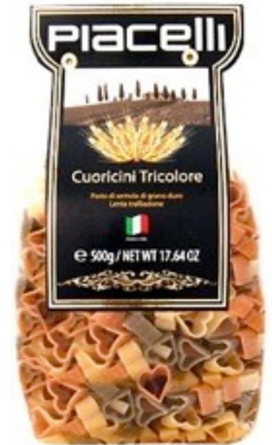
16654. Cuoricini 3-color 500g (16)