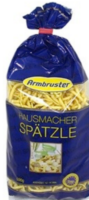
17099. Homemade 500g (10)