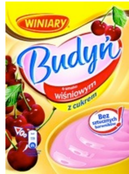
456.Cherry 60g (30)