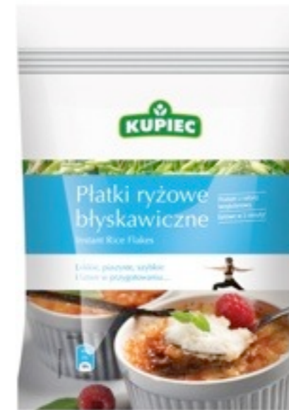
8186. Rice flakes 250g (12)