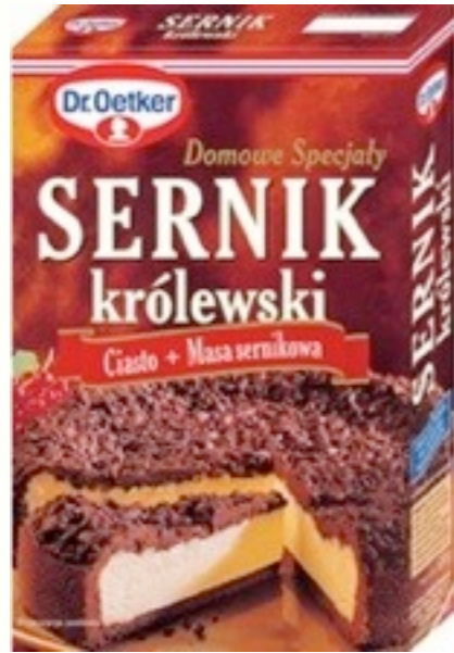
11777. Cheesecake 520g (8)