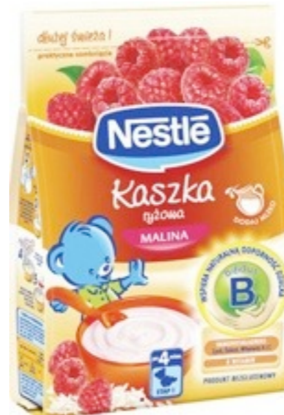
13536. Raspberry 180g