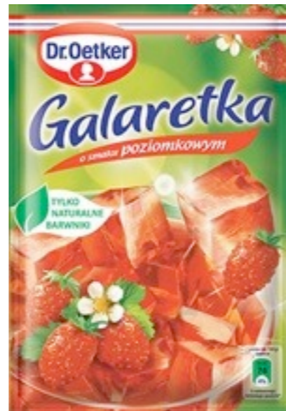
7425. Wild strawberry 75g (20)