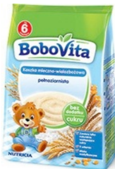
17166.Pełnoziarnista 230g (9)