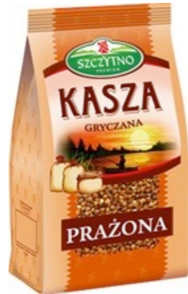
14964. Buckwheat 400g (12)