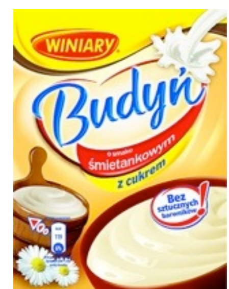
452.Cream 60g (30)