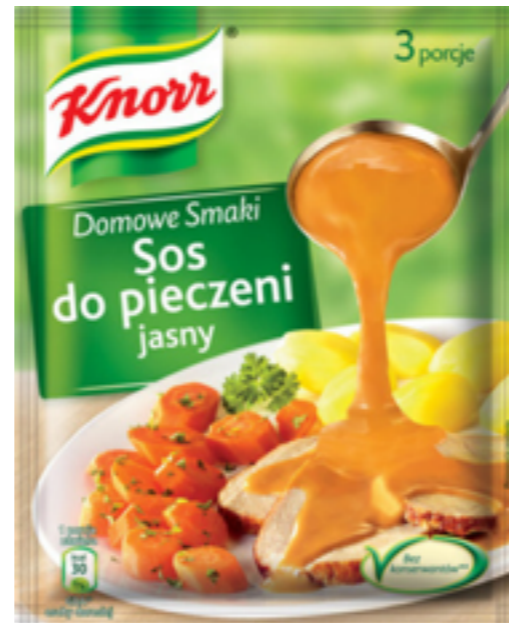
17243.Roasting light 25g (28)