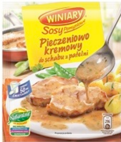
16696.Kremowy/schab 30g (35)