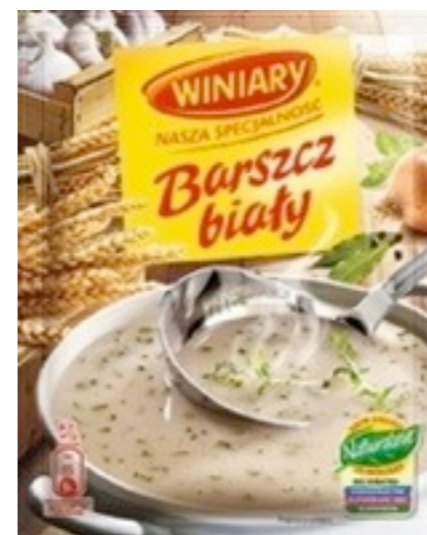
3091. Barszcz biały 66g (30)