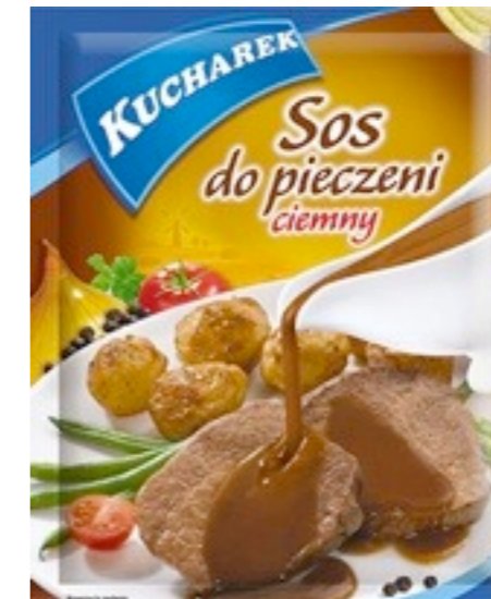
11021. Roasting dark 29g (20)