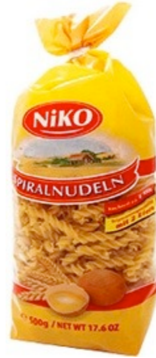
15916. Świderek 500g (10)