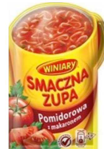
3206. Pomidorowa 18g (24)