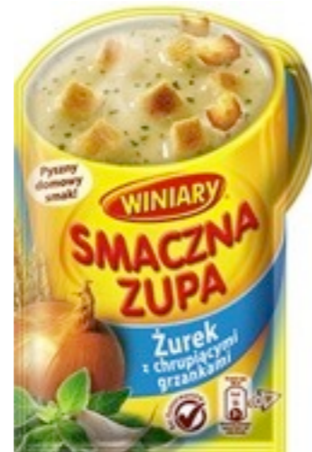
541. Żurek 14g (28)