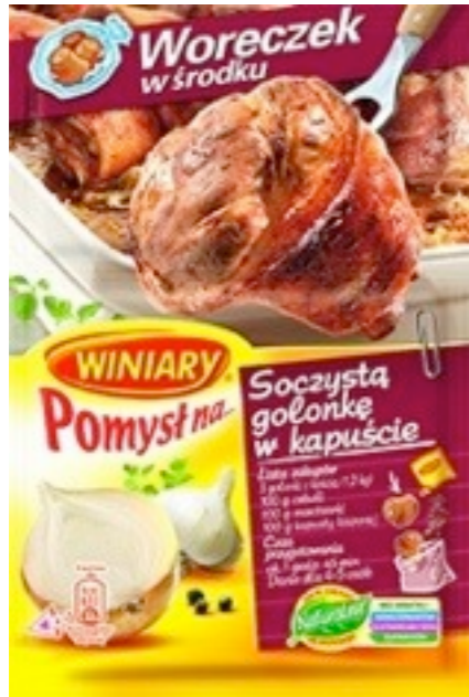
15463. Golonka 30g