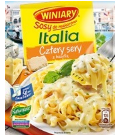
15459.4 sery 45g (25)