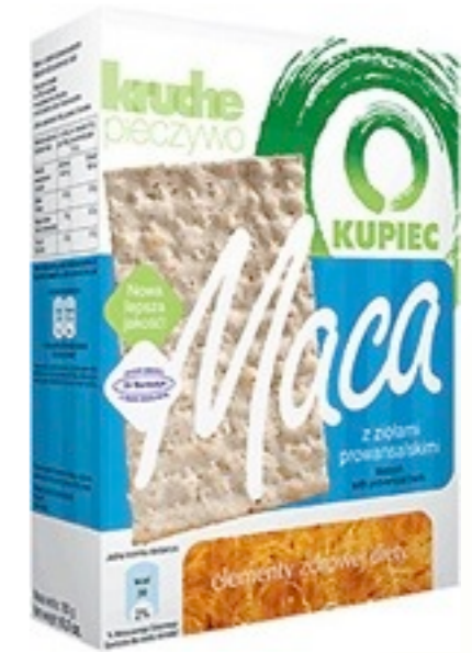
8192. Herbs 180g (10)