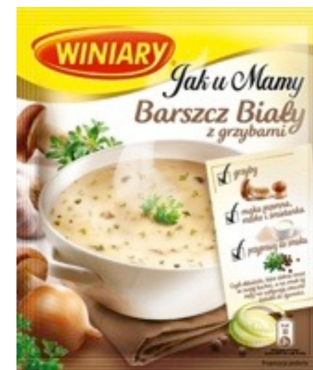
15443. Barszcz biały/grzyby 40g (30)