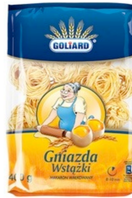
6445. Gniazda wstążki 400g (15)