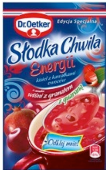
15552. Energy 32g (30)