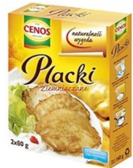
16742. Pancakes 2x80g