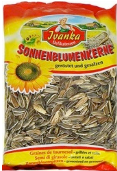
14565. Sunflower 400g