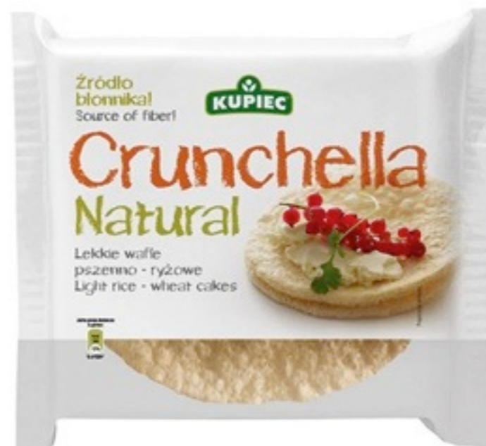
16295. Rice-wheat cakes 28g