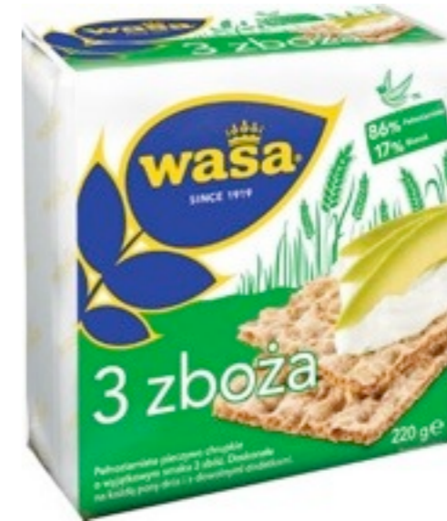
2396. 3 grain 220g (12)