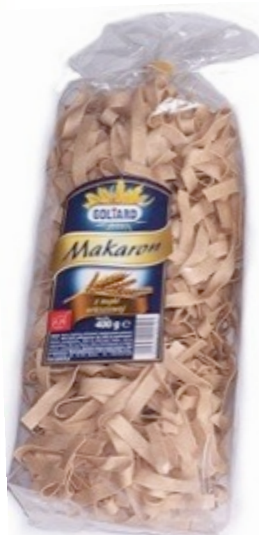
14470. Orkisz 400g (8)