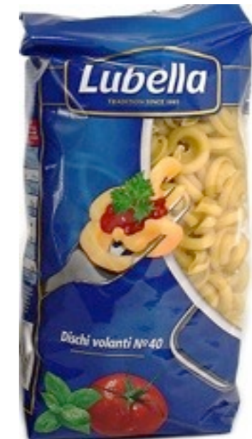
15156. Uszka 400g (12)