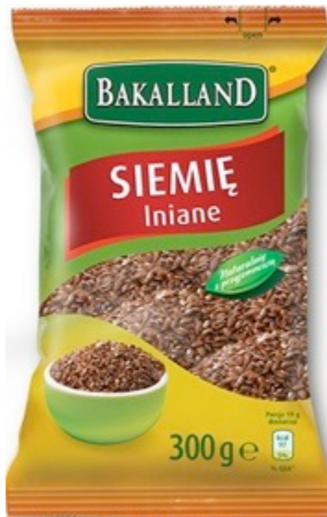
15197. Flaxseed 300g