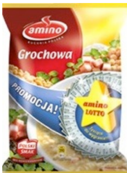
409. Pea 69g (22)