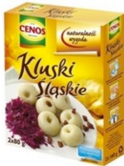
16743. Dumplings śląskie 2x80g