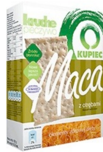
8193. Bran 180g (10)