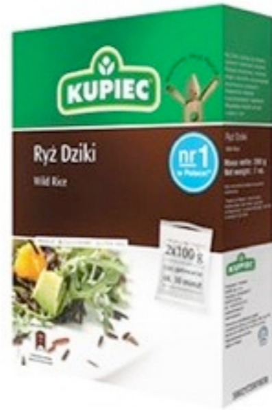
11167. Wild rice 200g (6)