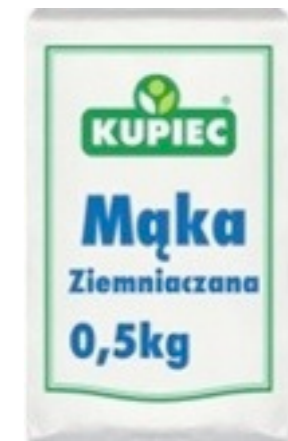
2575. Potato starch 500g (12)