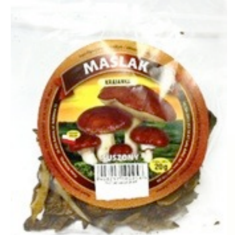
16683.Suillus 20g (50)