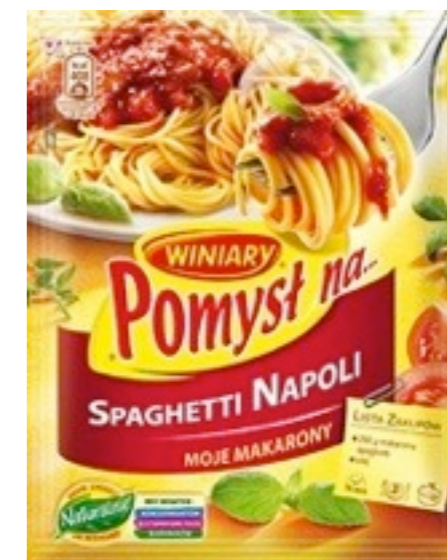
15472. Spaghetti Napoli 47g (25)