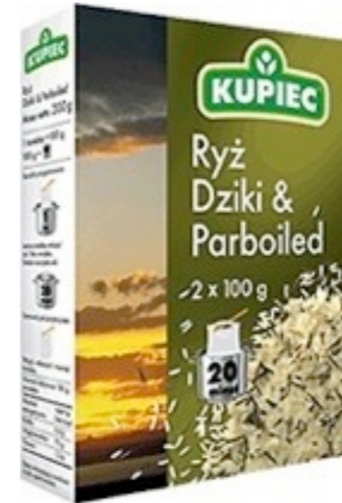
11929. Wild parboiled 200g (6)