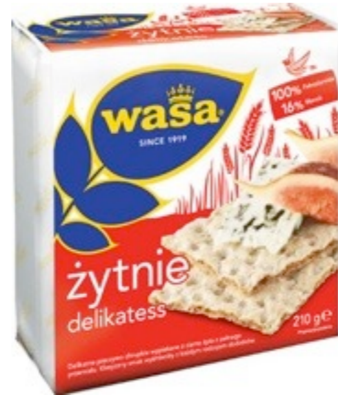
2394. Rye 220g (12)