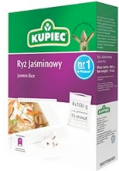
15790. Jasmin 400g (6)