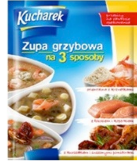
11514.Mushroom 42g (20)