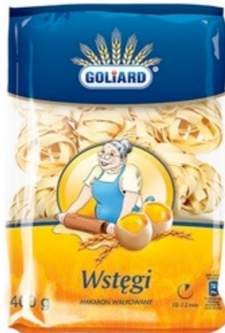
14464. Wstęgi 400g (15)