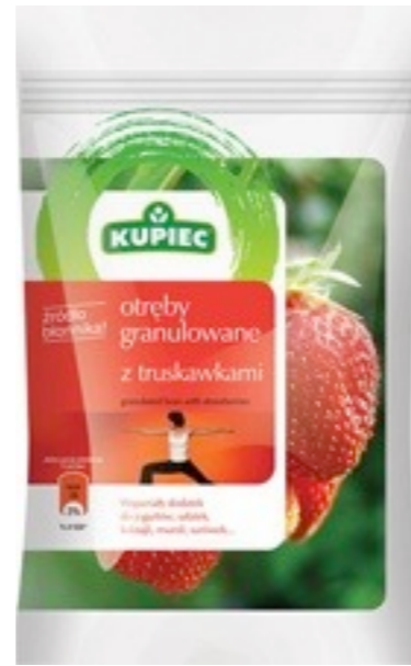
2019. Strawberry 120g (6)