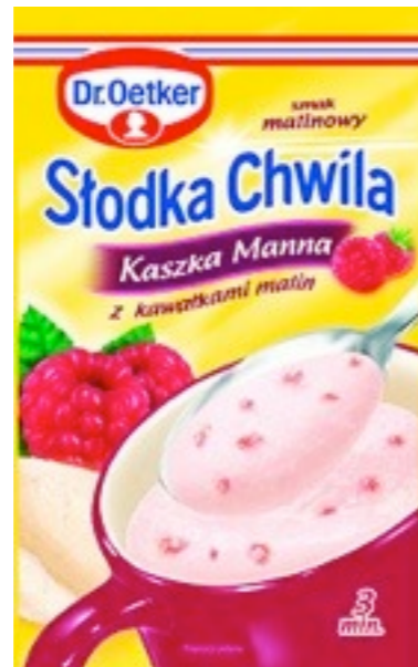
11800. Raspberry 49g