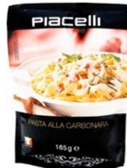
16650. Pasta/ham sauce 165g (12)