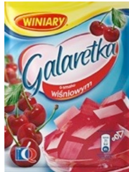
479.Cherry 75g (22)