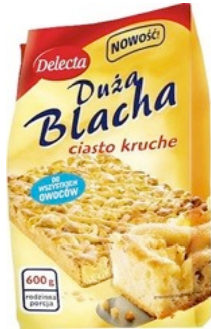
13592. Kruche 600g (5)