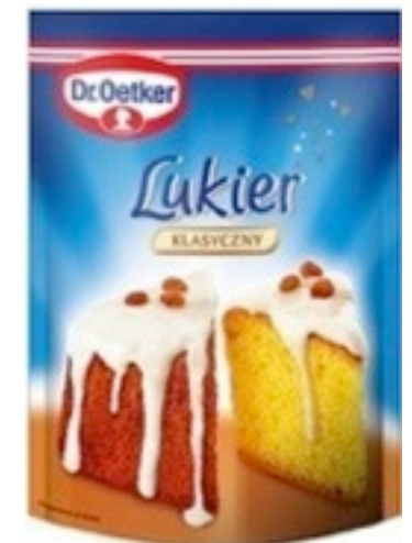
15572. Classic 100g (20)