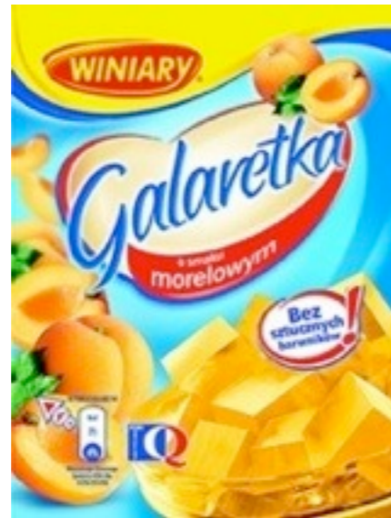
15477.Apricot 75g (22)