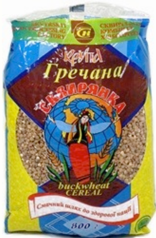
15730. Buckwheat 800g (9)