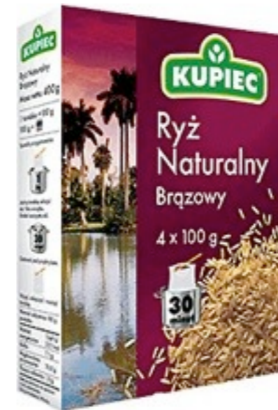
16307. Brown 400g (12)