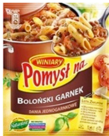
15465. Boloński garnek 45g (27)