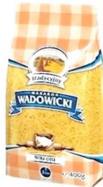
4602. Nitka cięta 400g (18)