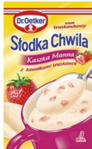
10062. Strawberry 49g