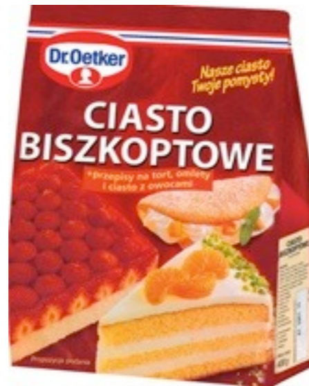
443. Sponge cake 400g (8)