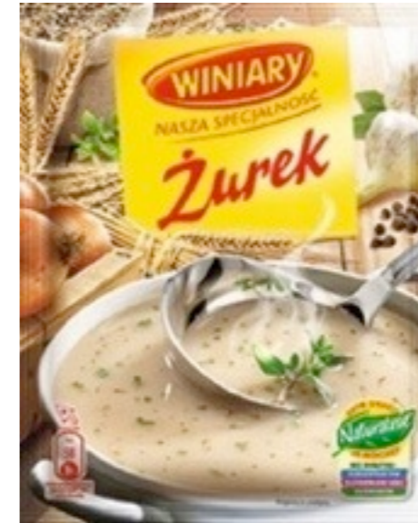
3131. Żurek 51g (30)