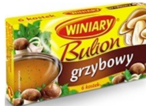
1776.Grzybowy 60g (32)