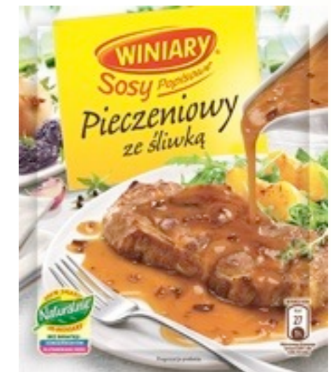
13849.Pieczenowy/śliwka 33g (22)