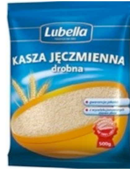
3952. Fine 500g (10)