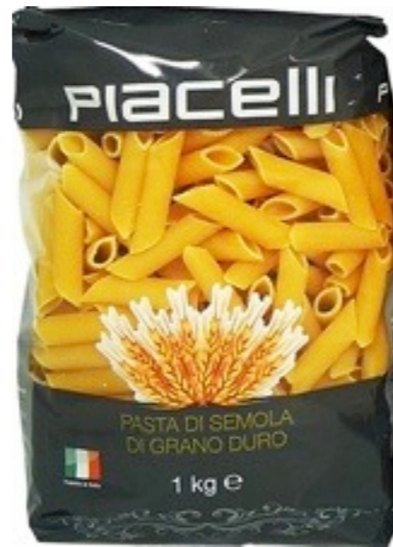
16915. Penne Rigate 500g (20)