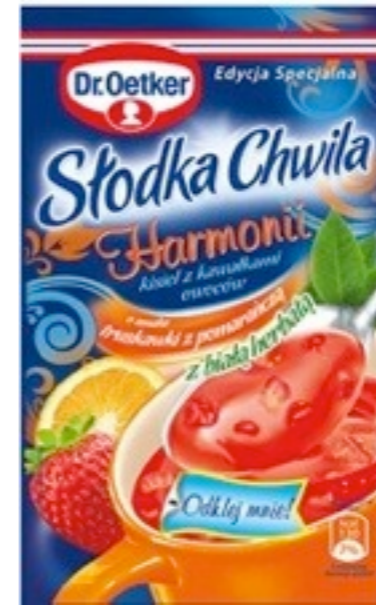
15549. Harmony 32g (30)