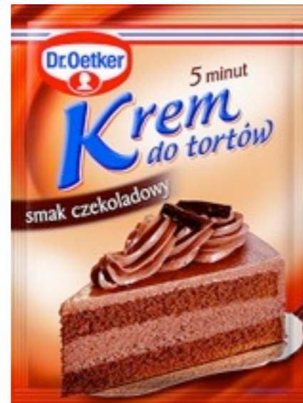
1497. Chocolate 140g (20)