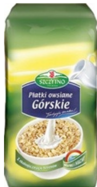
14972. Oat mountain 400g