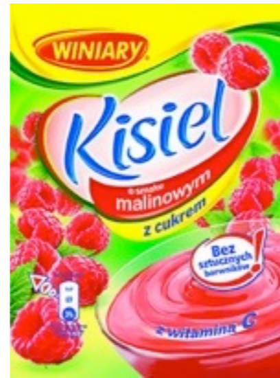
465.Raspberry 77g (25)