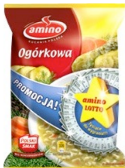
6107. Cucumber 67g (24)