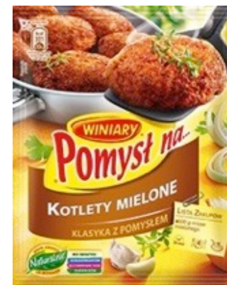
603. Kotlety mielone 69g (25)