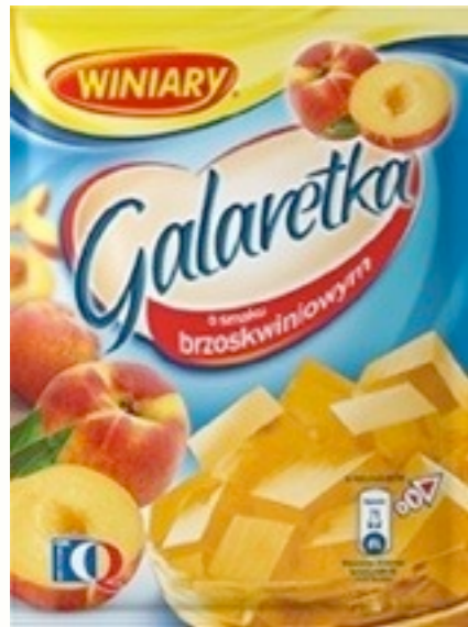
2691.Peach 75g (22)