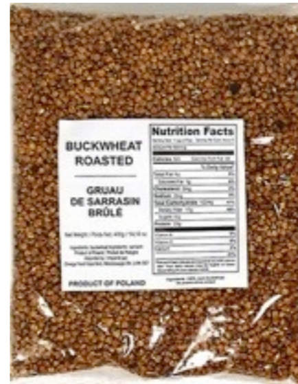
5347. Roasted 400g (35)