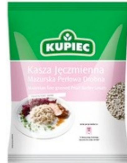
1146. Small 400g