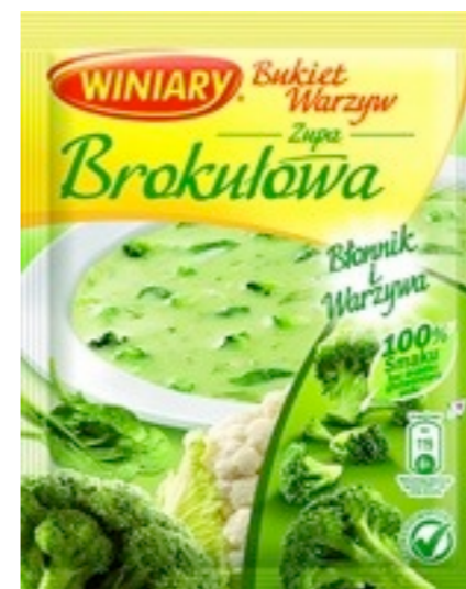
7733. Brokułowa 63g (24)