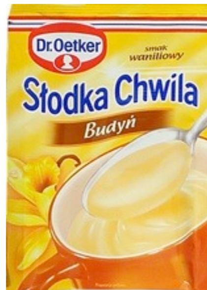
4699. Vanilla 43g (30)