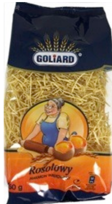
14473. Nitka rosółowa 250g (18)