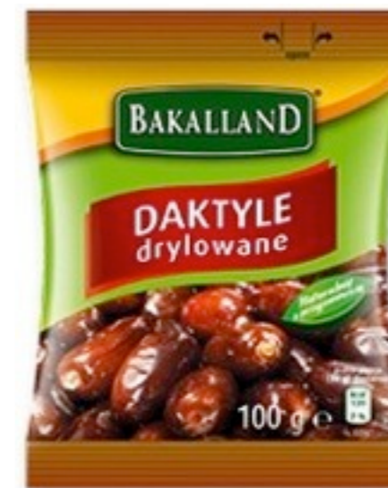
15814. Daktyle 100g