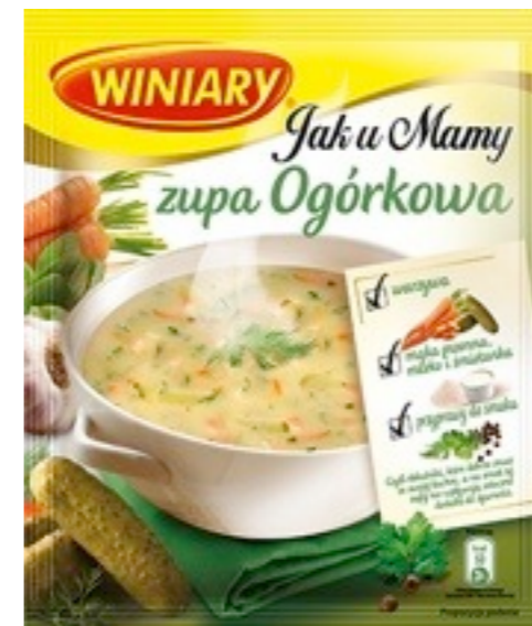
3277. Ogórkowa 44g (22)