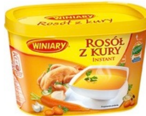
1170.Rosół instant 170g (10)