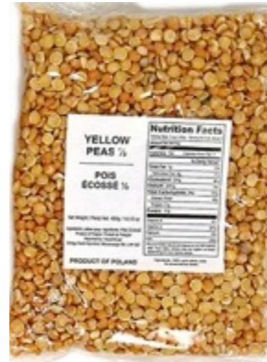
5343. Yellow peas 1/2 400g (35)