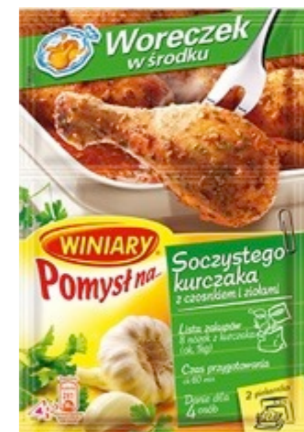
13488. Kurczak/czosnek 36g