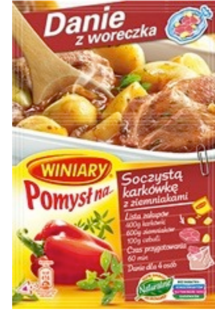
15469. Karkówka 34g