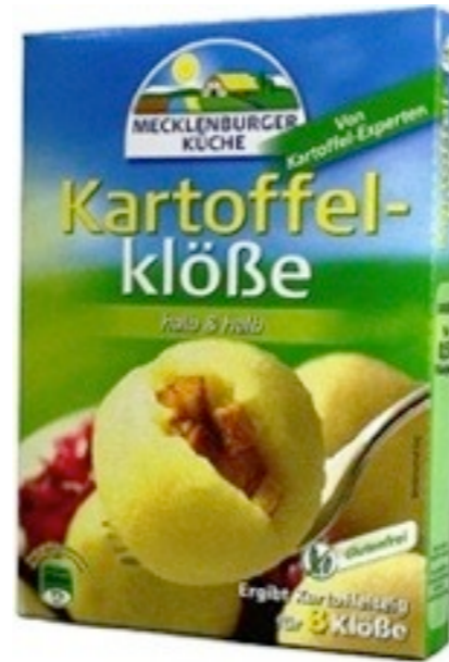
16034. Potato dumplings 225g (14)