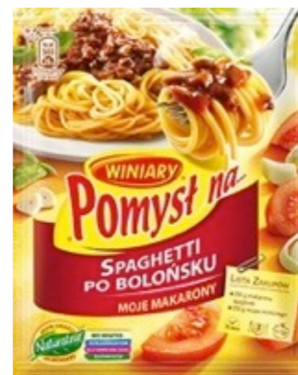
15471. Sp. bolońskie 44g (27)