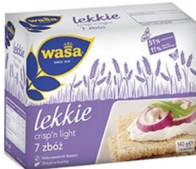
5224. 7 grains 140g (10)