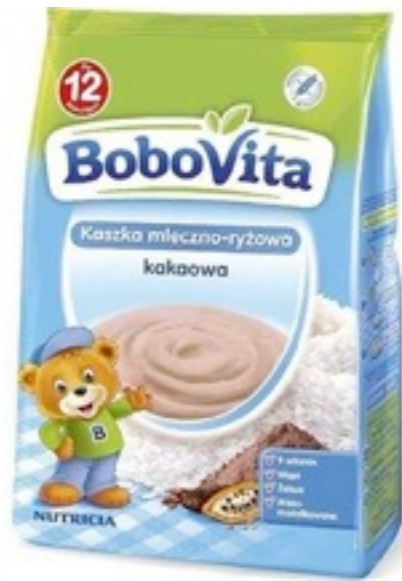
17162.Cocoa 230g (9)