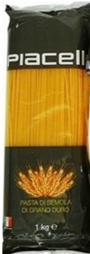
14561. Spaghetti 1kg (12)