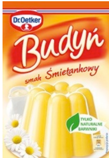
7432. Cream 43g (30)