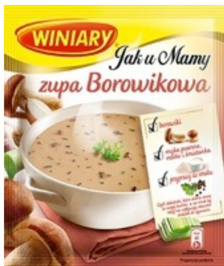
10656. Borowikowa 45g (30)