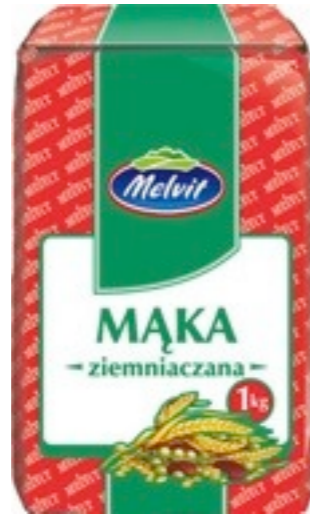
15905. Potato 1kg (10)