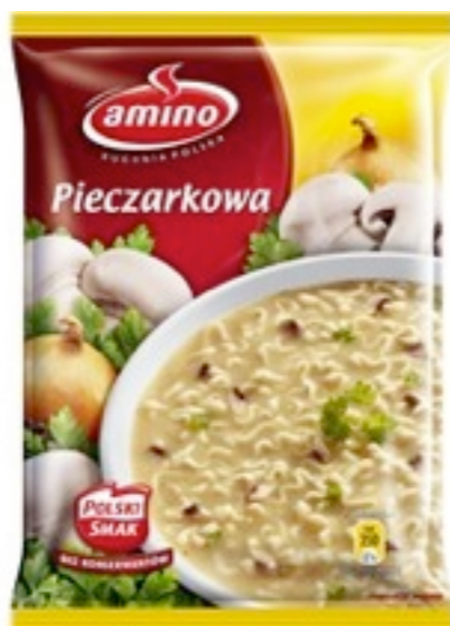
406. Mushroom 69g (22)