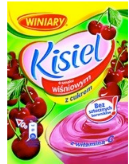
463.Cherry 77g (25)