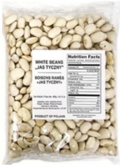
5230. Jas Tyczny 400g (30)