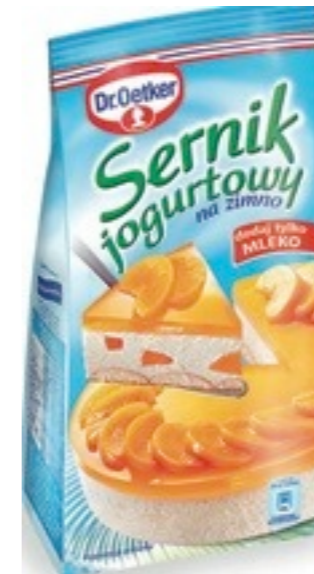
445. Yogurt 195g (8)