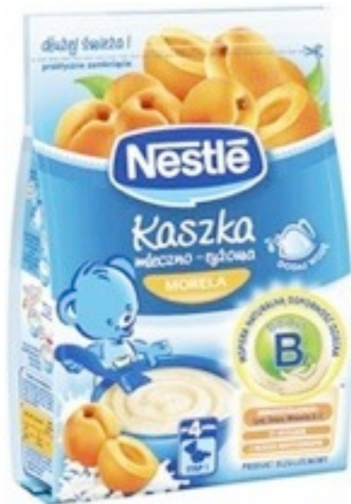
490.Apricot 230g (8)