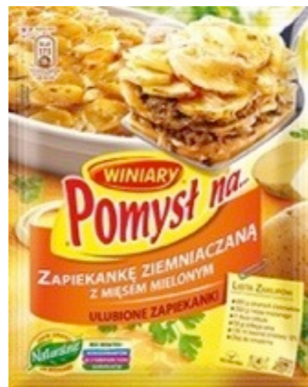
15475. Zapiekanka mięso 42g