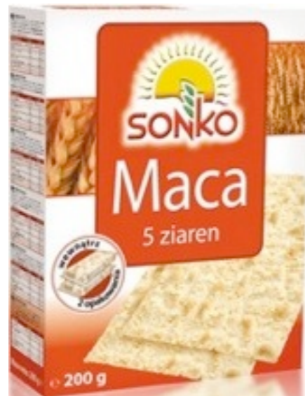
14227. Five grain 200g (10)