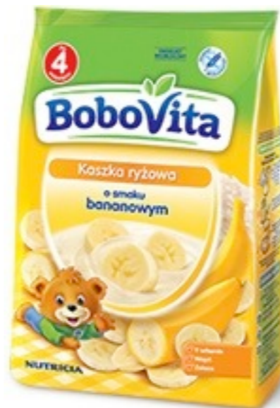
13561.Banan 180g (9)