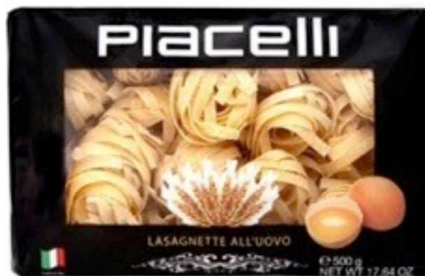
16656. Lasagnette 500g (12)