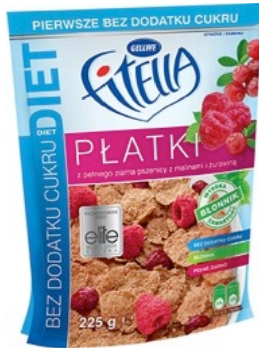
17018. Raspberry-cranb. ns 225g (12)