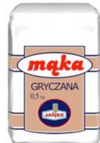
5345. Buckwheat flour 500g (10)