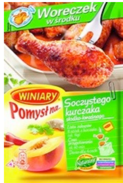
15464. Kurczak/sł-kwaśny 33g