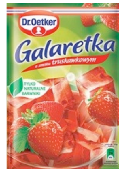
7426. Strawberry 75g (20)