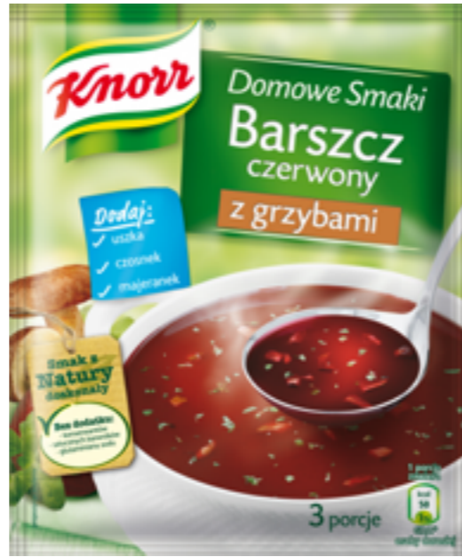
17249.Red borsch/mushroom 41g