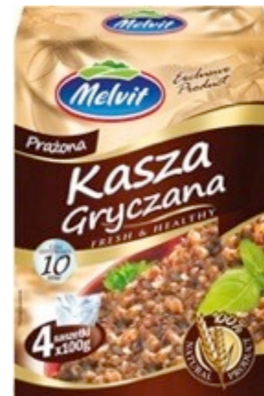
15906. Buckwheat 4x100g (10)