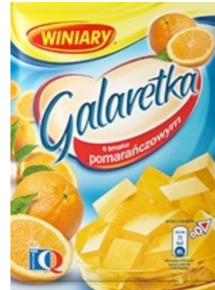
476.Orange 75g (22)