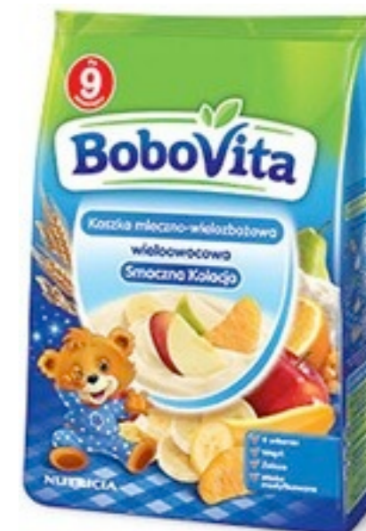
17169.Wieloowocowa 230g (9)