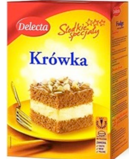
13590. Krówka 530g (7)