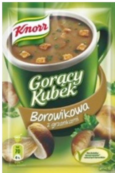
17266.Boletus 16g (40)