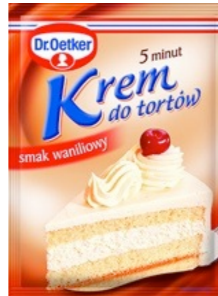
1388. Vanilla 120g (20)