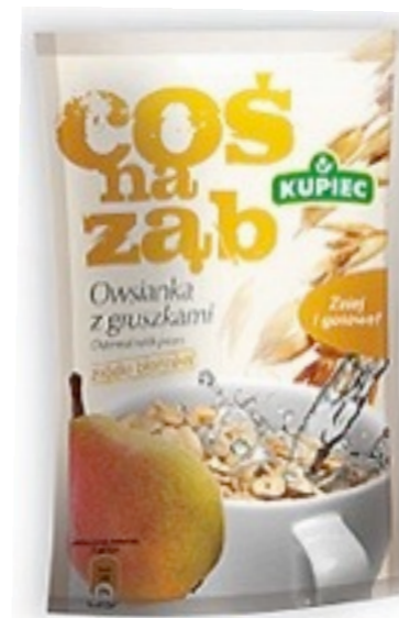
16297. Pear 50g (14)