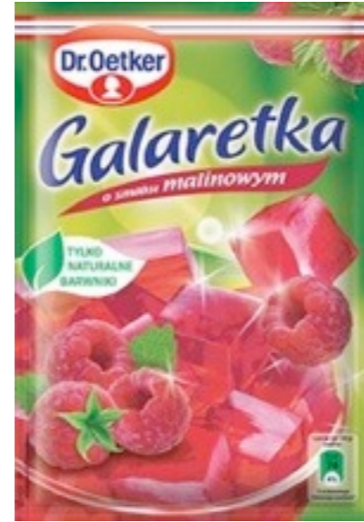
7421. Raspberry 75g (20)