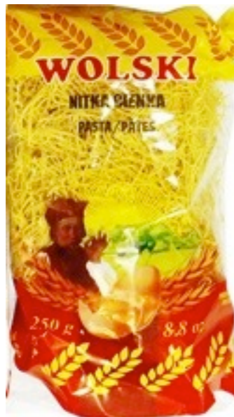
2235. Nitka cienka 250g (30)