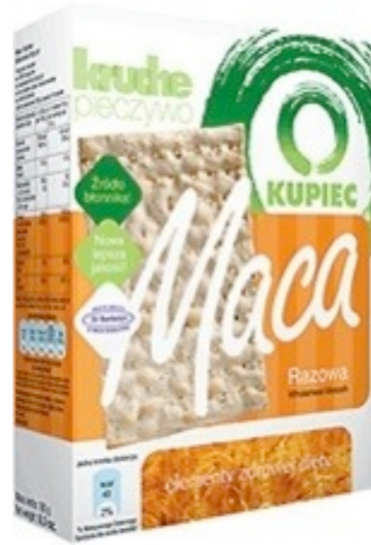
8190. Wholegrain 180g (10)