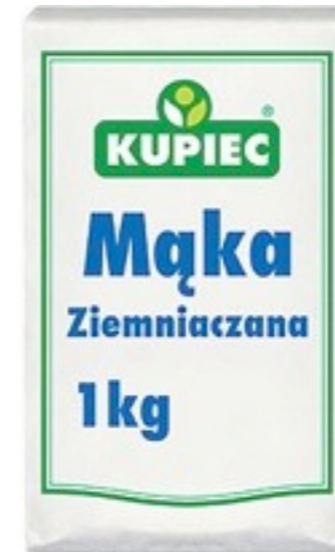
10204. Potato starch 1kg (10)