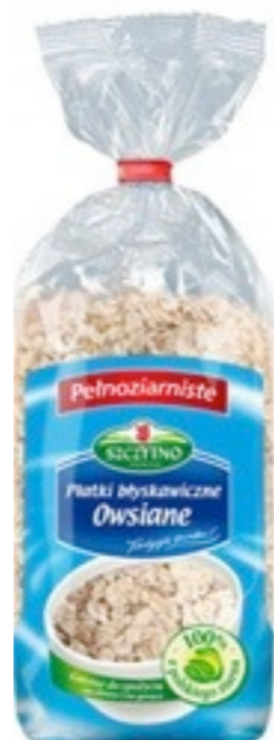
16832. Oat 400g