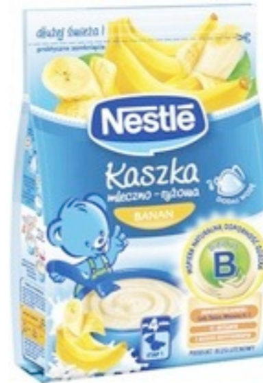
492. Banan 230g (8)