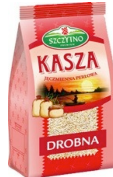
14969. Fine 400g (12)