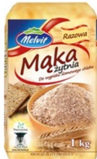
14963. Rye 1kg (10)