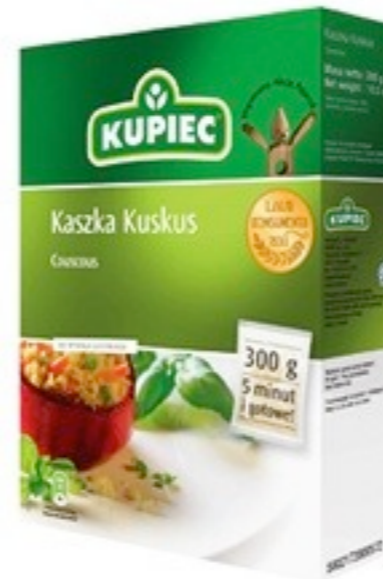
15785. Kuskus 300g