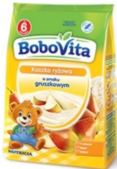
13564.Pear 180g (9)