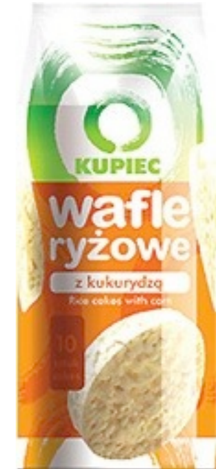
16294. Corn 120g