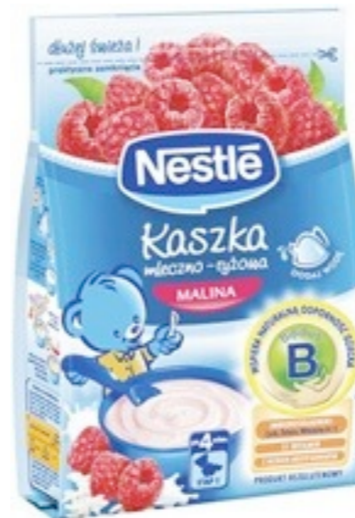
13536.Raspberry 230g (8)