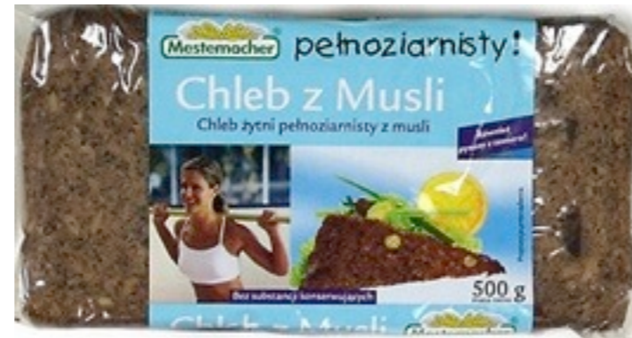
14950. Musli 500g (12)