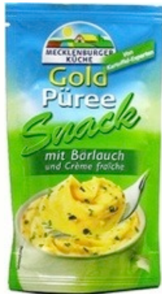
16283. Puree chives 10g (10)