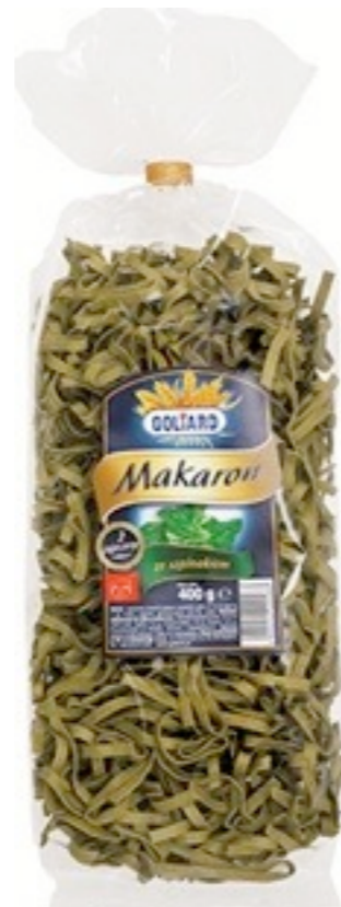
14468. Szpinak 400g (8)