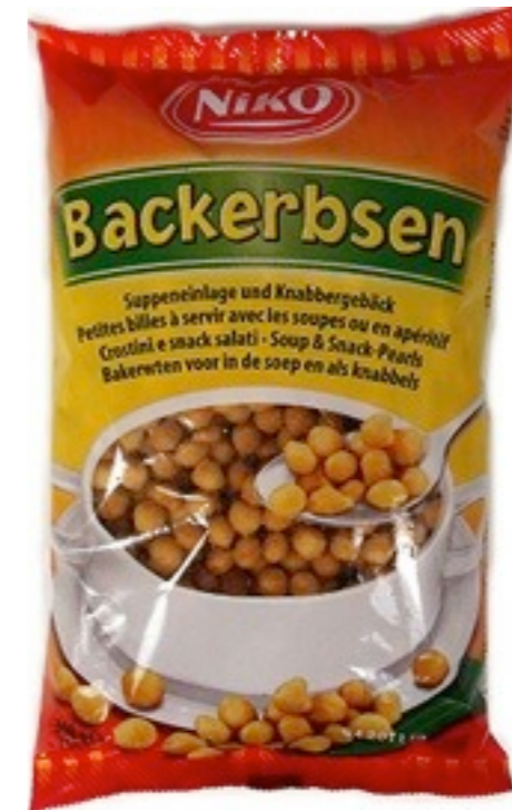
14795. Fried butter pearls 300g