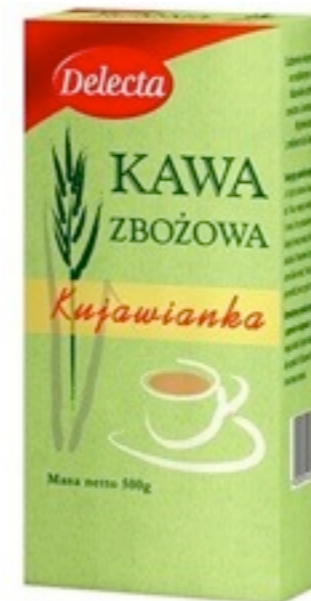
11761. Kujawianka 200g (18)