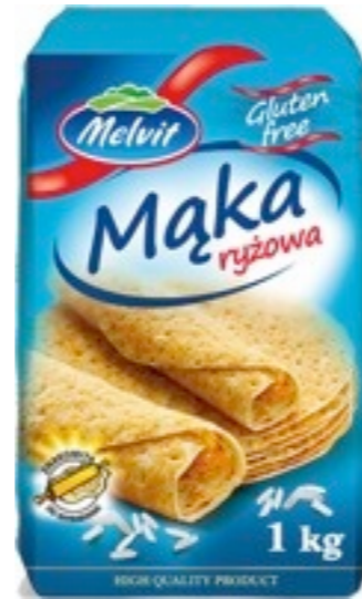
15902. Rice 1kg (10)