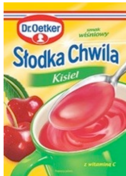
11794. Cherry 30g (30)