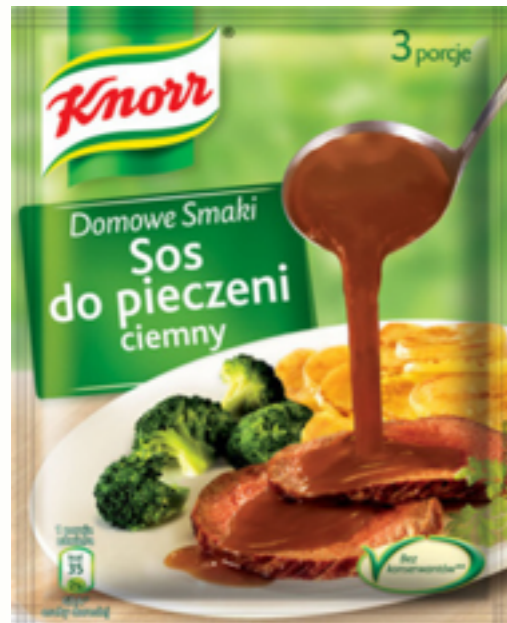
17241.Roasting dark 30g (28)