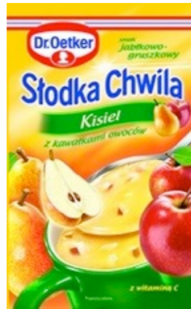
11799. Apple-pear 32g (30)