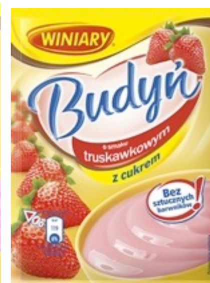
17016.Strawberry 60g (30)