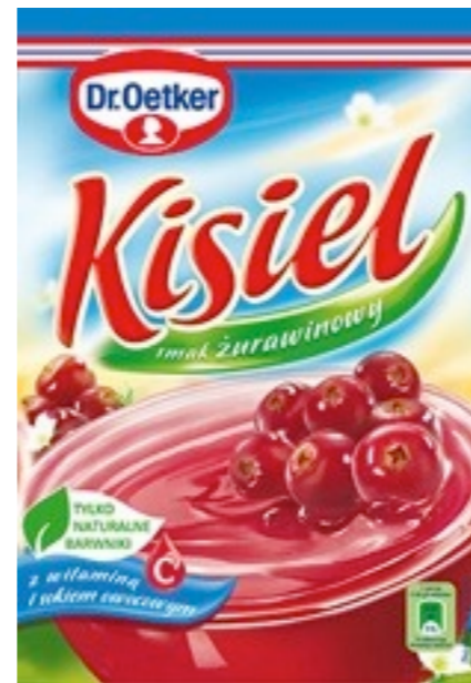
15553. Cranberry 38g