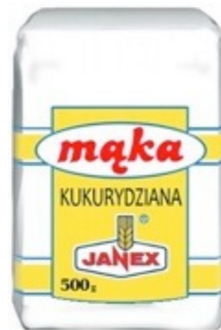
5344. Corn flour 500g (10)