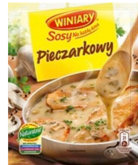
510. Pieczarkowy 32g (35)