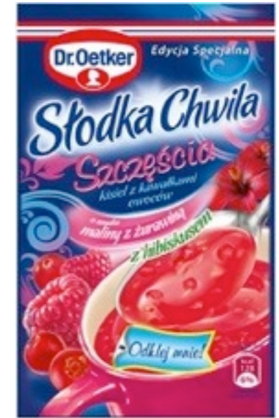
15551. Happiness 32g (30)