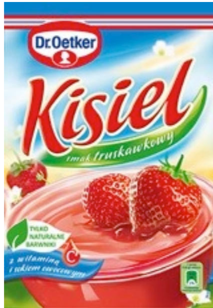
7903. Strawberry 38g