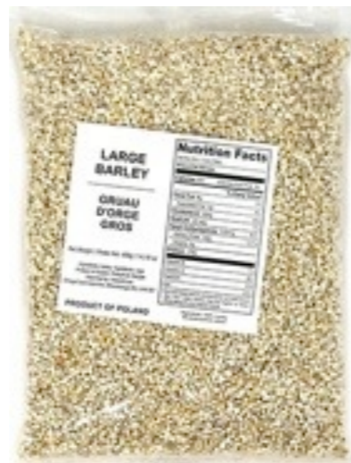
5337. Large 400g (30)