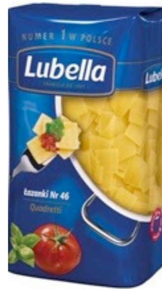
4018. Łazanka 500g (12)