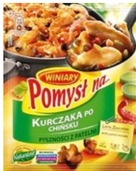
7735. Kurczak/chiński 37g (22)