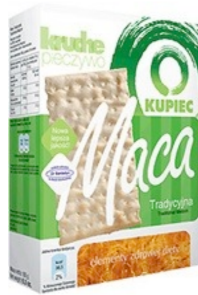
8191. Traditional 180g (10)