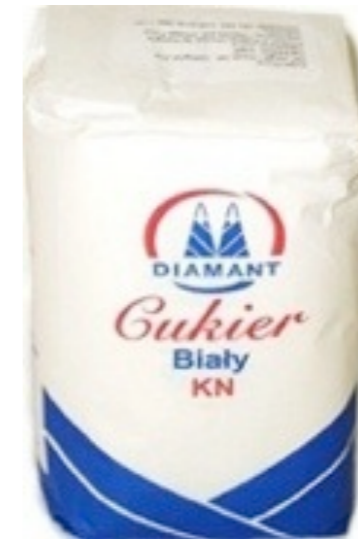
4061. Sugar 1kg (10)