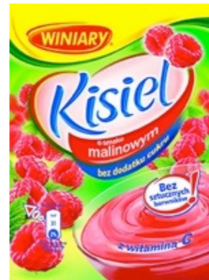
7740.Raspberry bc 38g (30)