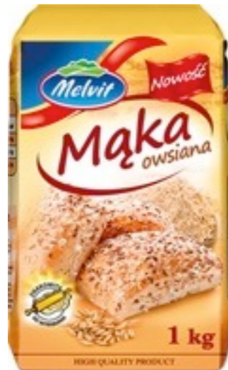
15903. Oat 1kg (10)