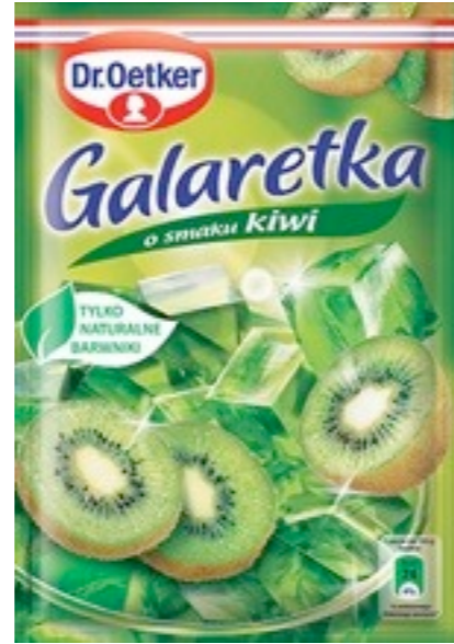
9414. Kiwi 75g (20)