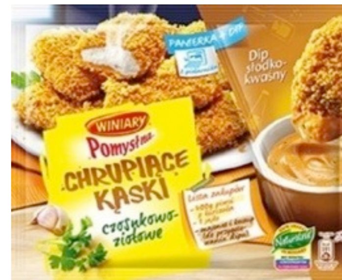
15483. Kąski zielone 89g