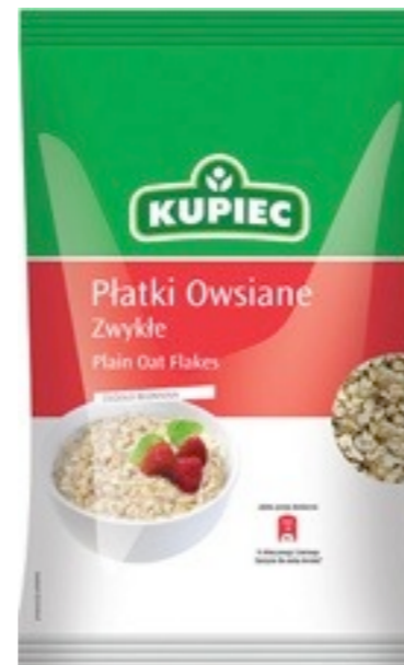
8188. Oat flakes 400g (16)