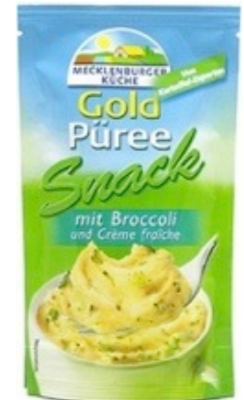
16281. Puree broccoli 10g (10)