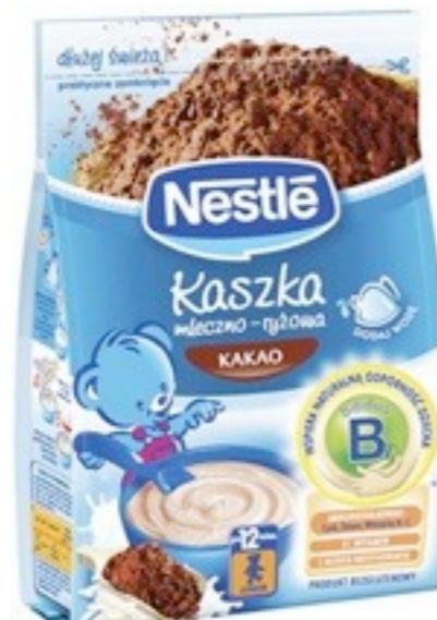
13537.Cocoa 230g (8)