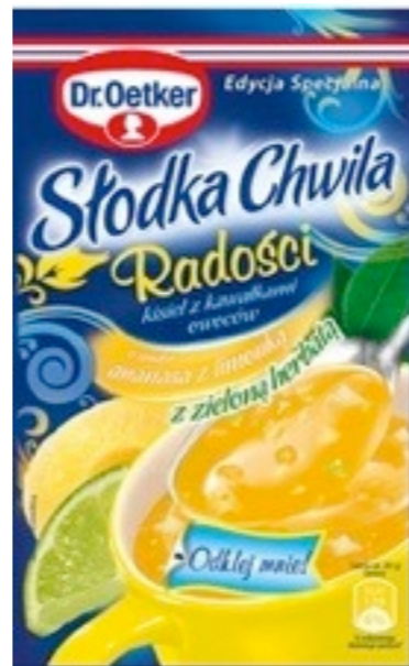
15548. Joy 32g (30)