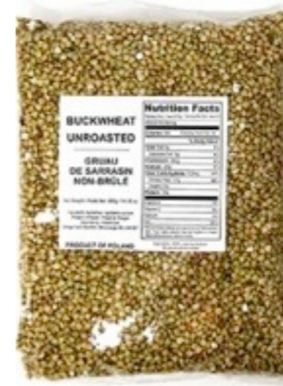
5232. Unroasted 400g (35)