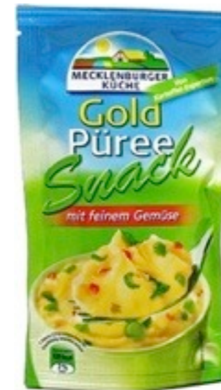
16280. Puree vegetables 10g (10)