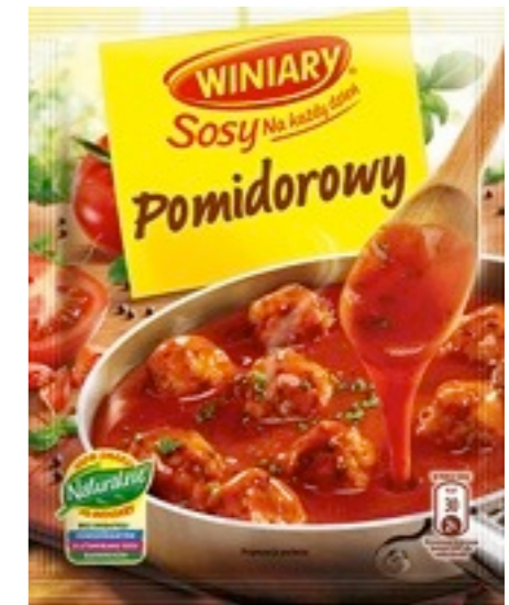
513.Pomidorowy 36g (35)