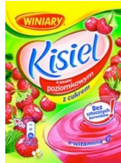
467.Wild strawberry 77g (25)