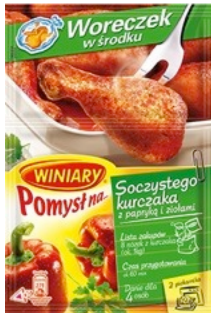
14292. Kurczak/papryka 34g