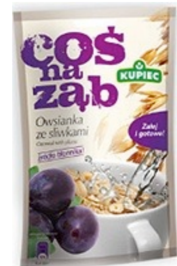
14821. Plum 50g (14)