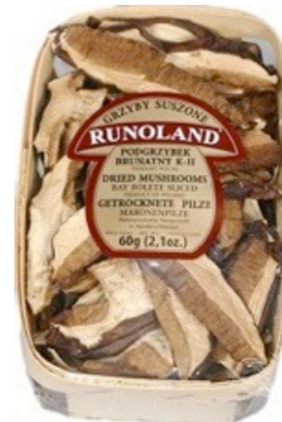
8009.Scaber 60g (10)