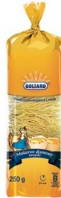
6442. Nitka swojska 250g (40)