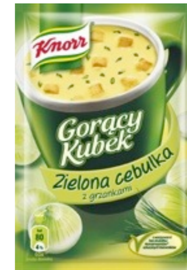
17275.Green onion 16g (36)