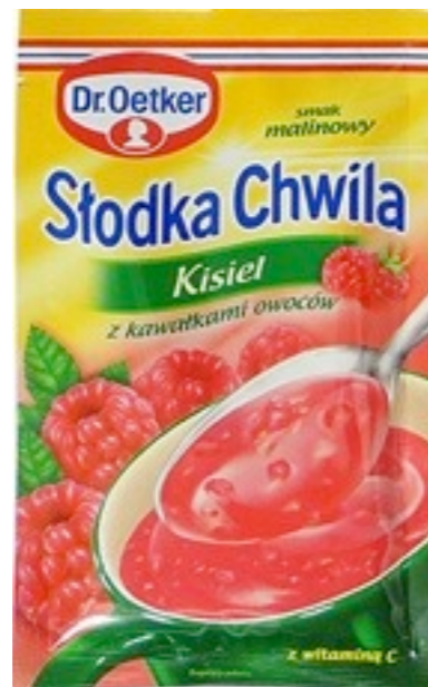
487. Raspberry 32g (30)