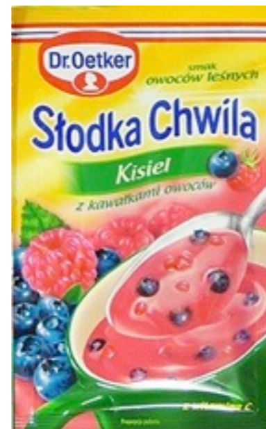
11795. Forrest 32g (30)