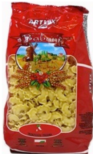
11534. Kolanko 400g (18)