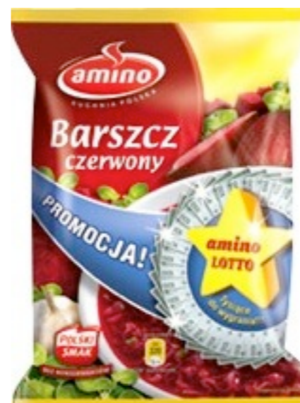
405. Red borsch 69g (22)