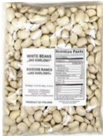
12356. Jas Karłowy 400g (30)