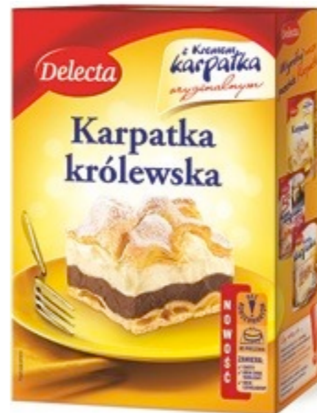
15743. Karpatka królewska 410g (7)