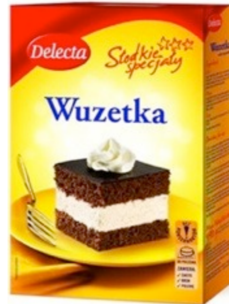
1306. Wuzetka 490g (5)