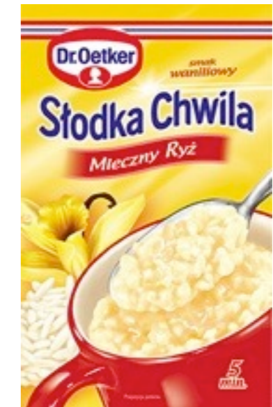
7412. Rice vanilla 58g