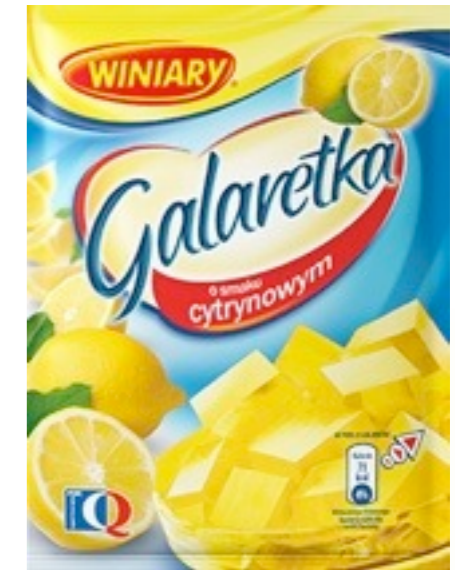
478.Lemon 75g (22)