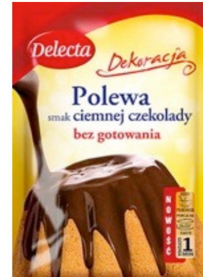
13599. Dark powder 100g (20)