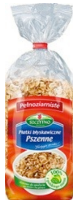
16026. Wheat 400g