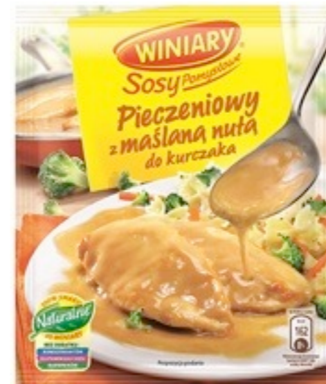
16784.Pieczenowy/kurczak 35g (35)