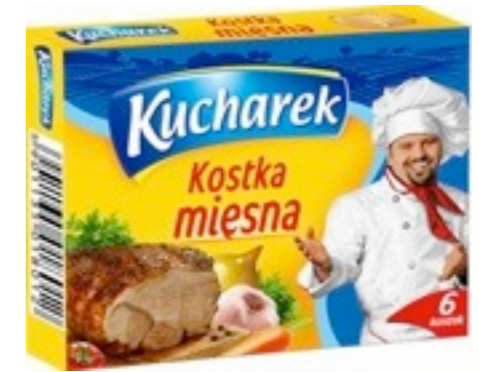
5695.Meat 6k (24)