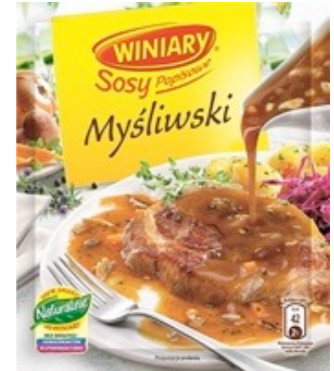
512. Myśliwski 30g (20)