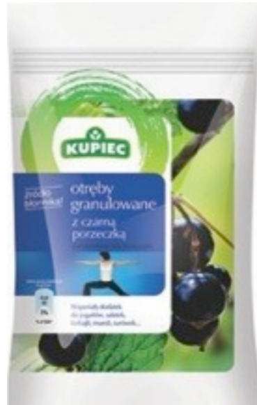
8185. Blackcurrant 120g (6)