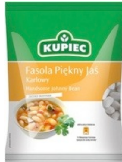
1620. Bean JOHN 400g (14)