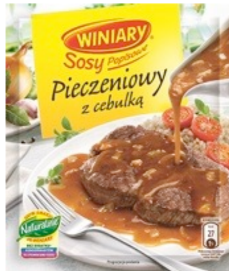
14290.Pieczenowy/cebulka 32g (22)