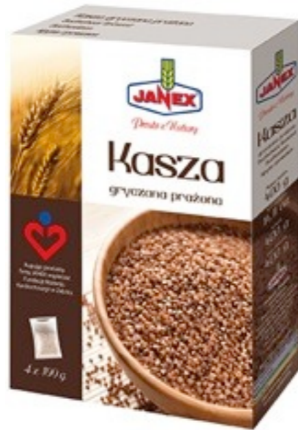
11076. Buckwheat 4x100g (20)