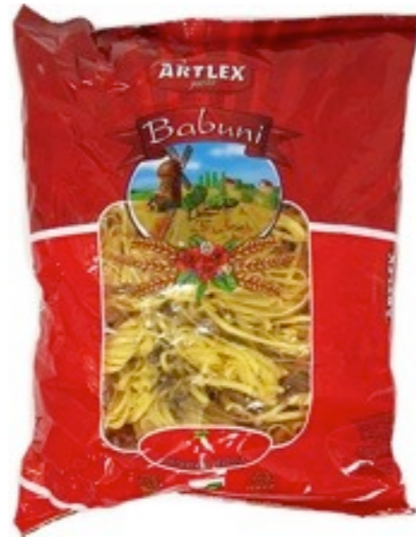
11537. Gniazda wstążka 400g (10)