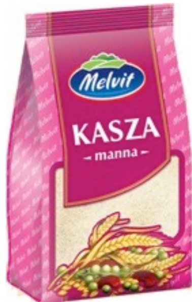
15908. Semolina 400g (12)