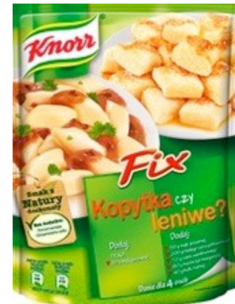
16741.Dumplings 195g (10)