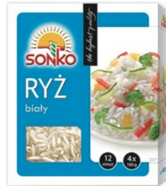
3296. Rice white 4x100g (12)