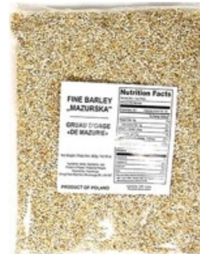
5338. Fine 400g (30)