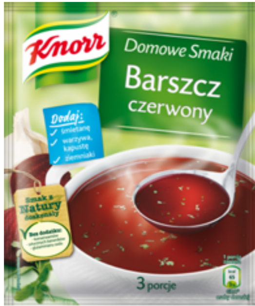
17248.Red borsch 53g