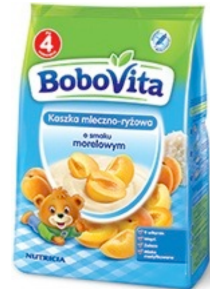
13568.Apricot 230g (9)