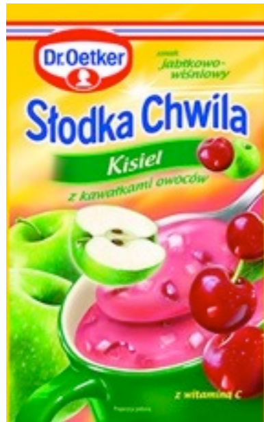
11798. Apple-cherry 32g (30)