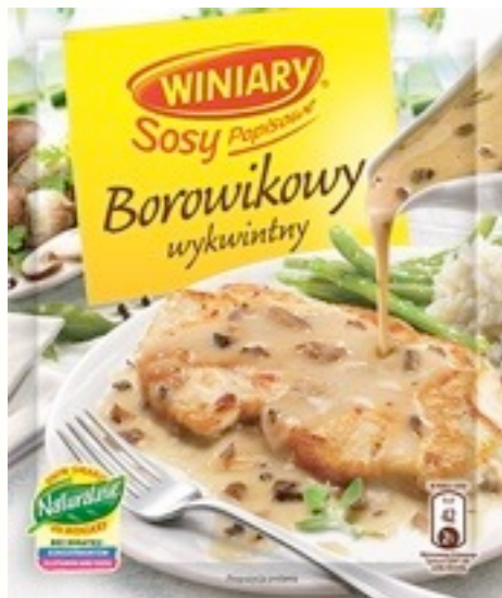
12956. Borowikowy 37g (20)