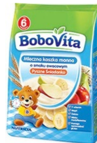
17164.Manna owocowa 230g (9)