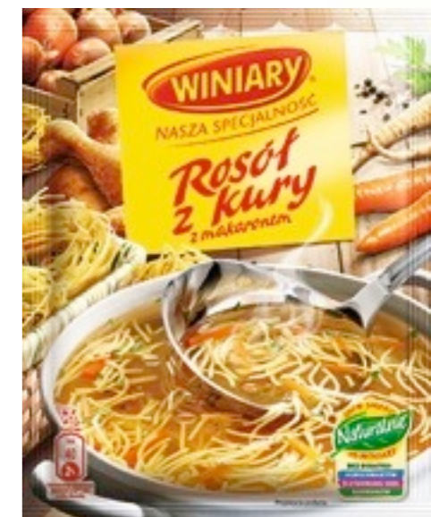
7731. Rosół z kury 48g (20)