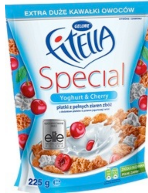
17013. Yogurt&cherry 225g (8)