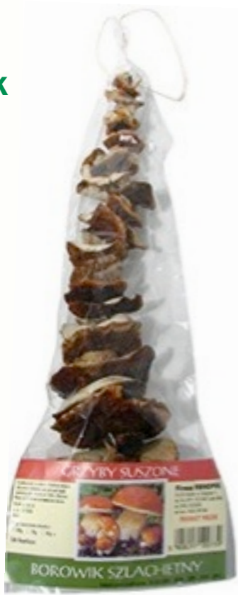
10221.Boletus 100g (1)