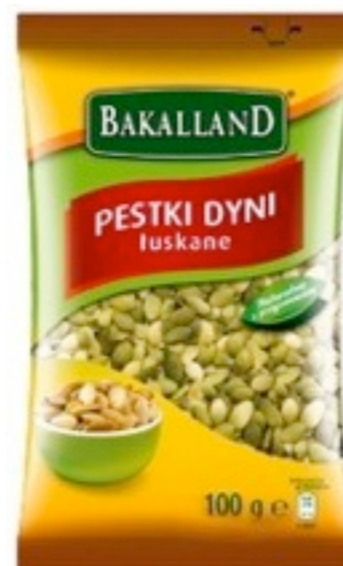
15815. Pumpkin seeds 100g