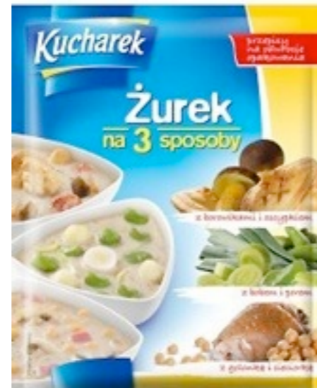
11516.Sour rye 46g (20)