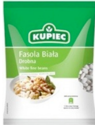
2391. Fine bean 400g (14)