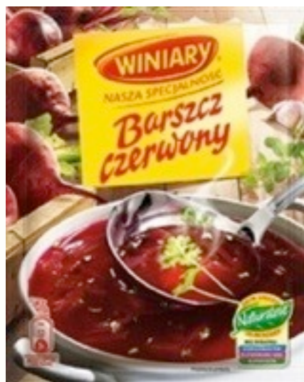
525. Barszcz czerwony 49g (20)