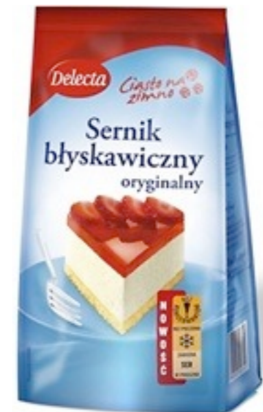
1315. Cheesecake 205g (10)