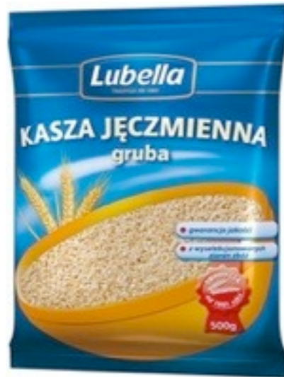
3953. Barley thick 500g (10)