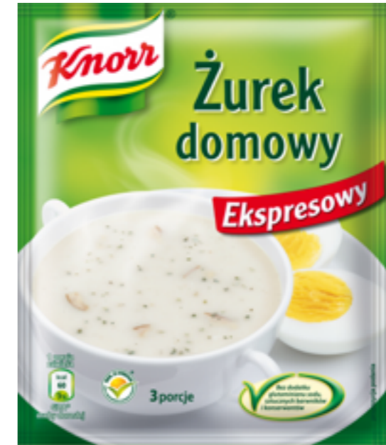
17251.Sour rye 42g