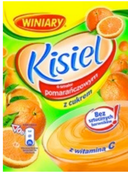
1919.Orange 77g (25)