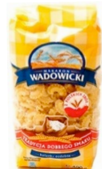
16457. Wadowicki kolanko 400g (18)