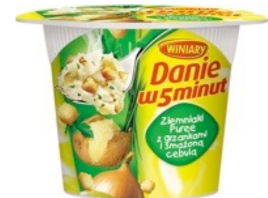
2682.Puree cebulka 57g (8)