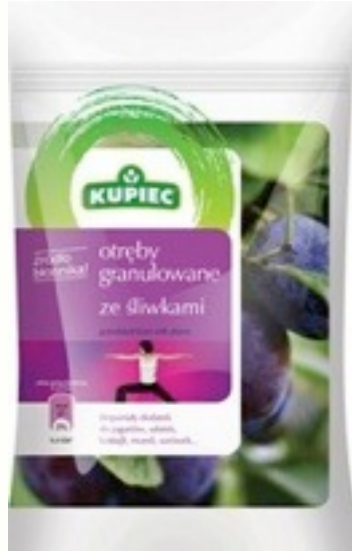
2051. Plum 120g (6)