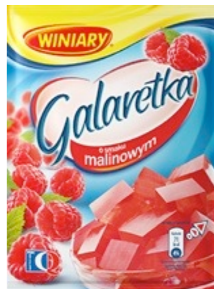
482.Raspberry 75g (22)