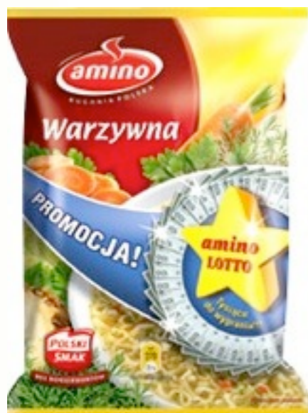
402. Vegetable 62g (24)