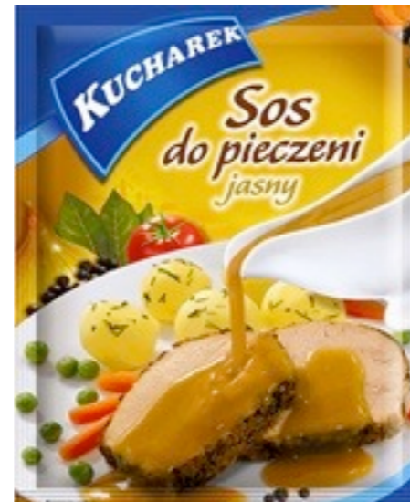
5703. Roasting light 29g (20)