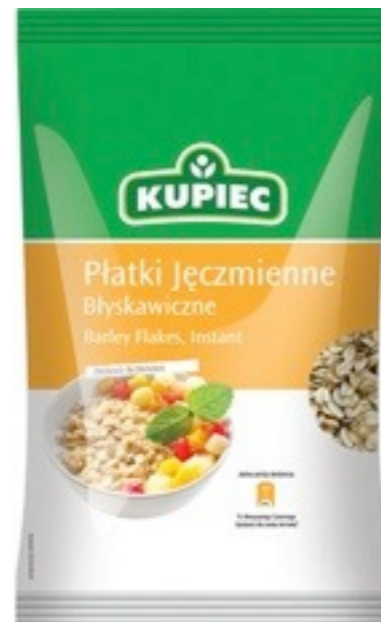
2390. Barley flakes 400g (16)