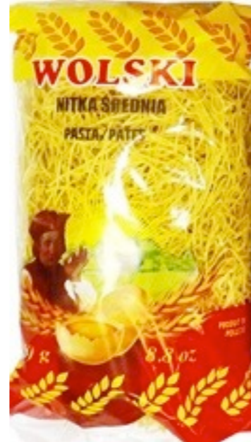
3390. Nitka średnia 250g (30)