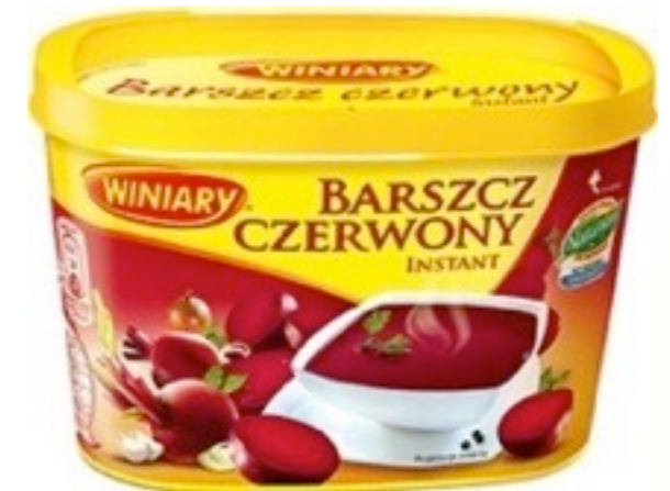
1169.Barsz czerwony instant 170g (10)