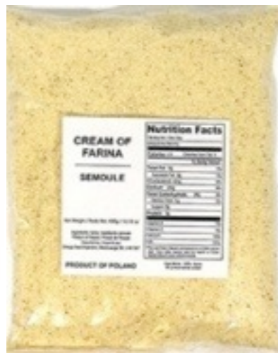
5498. Semolina 400g (30)