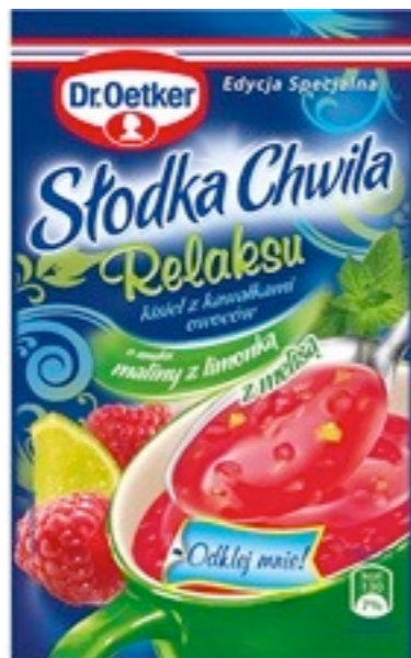
15550. Relax 32g (30)