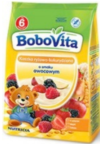
13574.Multifruit&corn 230g (9)