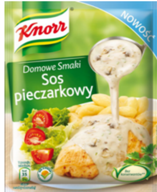
17245.Mushroom 27g (22)