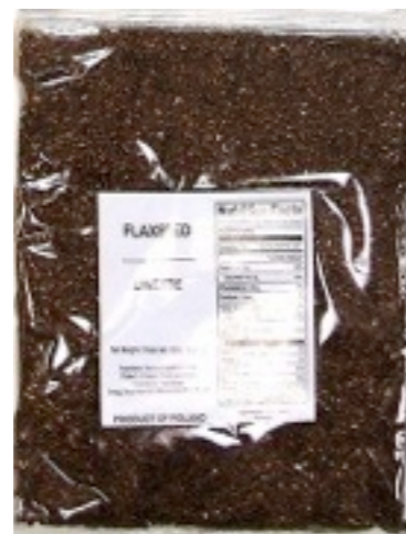
5341. Flax seed 250g (50)