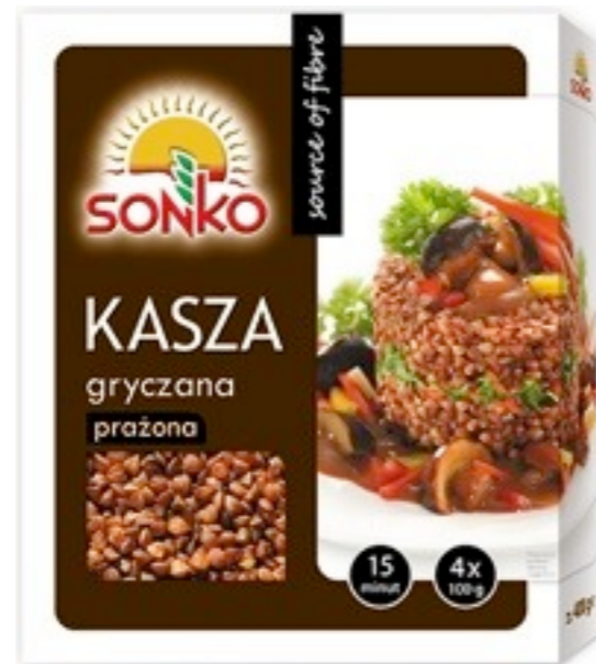
1137. Buckwheat 4x100g (12)