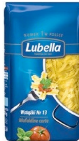
5453. Wstążki 500g (18)