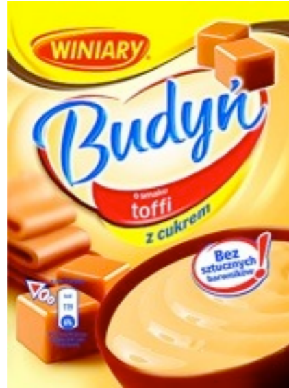
2686.Toffi 60g (30)