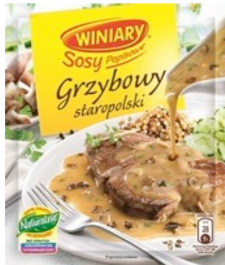
511. Staropolski 35g (20)