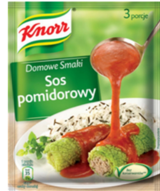
17244.Tomato 30g (28)