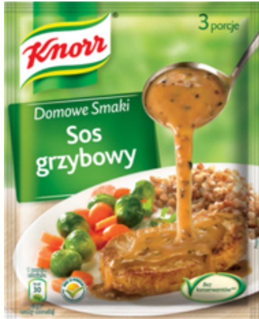
17240.Wild mushroom 24g (22)