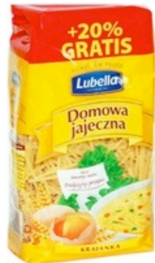
4887. Krajanka 250g (18)