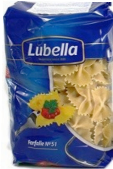
15154. Kokardki 400g (12)