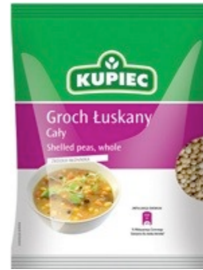
2577. Pea whole 400g (16)