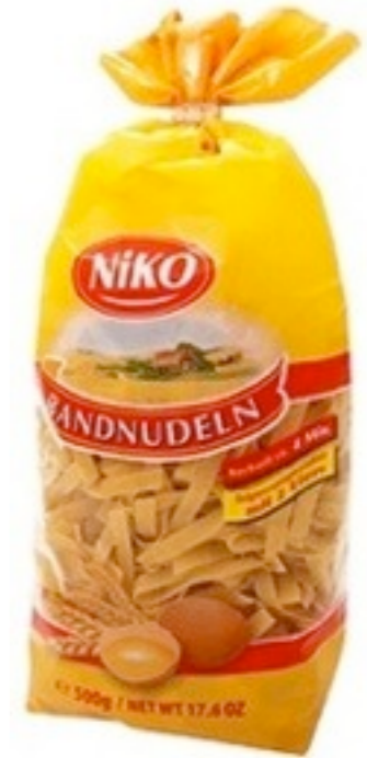
15915. Wstążka 500g (10)