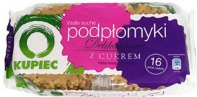
2578. With sugar 145g (12)