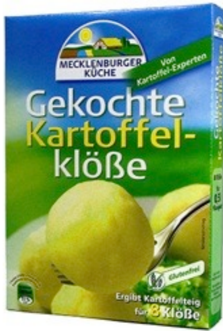
16033. Cooked dumplings 250g (14)