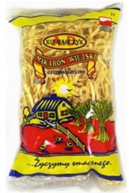
11510. Wstążka łazankowa 250g (30)