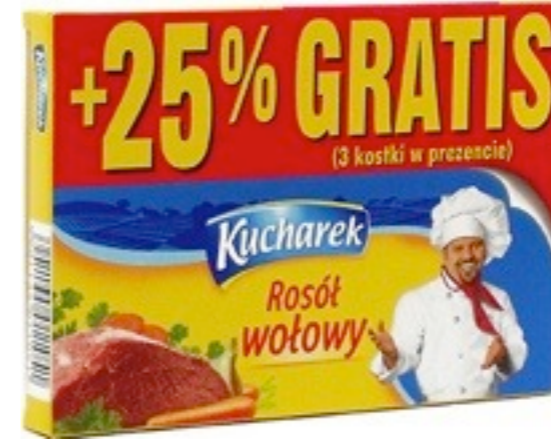
4253.Beef 12k (12)