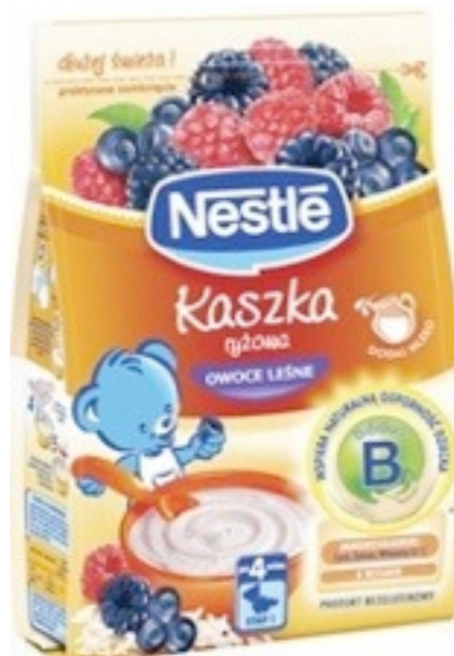
13532. Forrest 180g