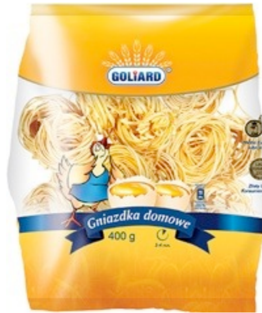
14465. Gniazda domowe 400g (15)