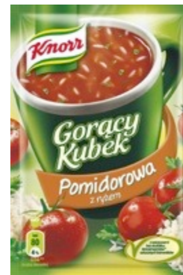
17274.Tomato 20g (40)