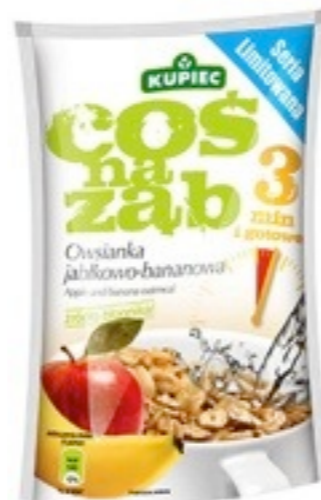
15792. Apple-banan 50g (14)