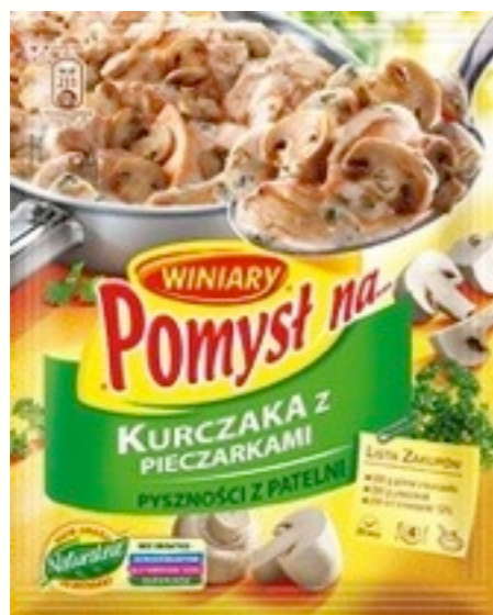
12958. Kurczak pieczarki 32g (22)