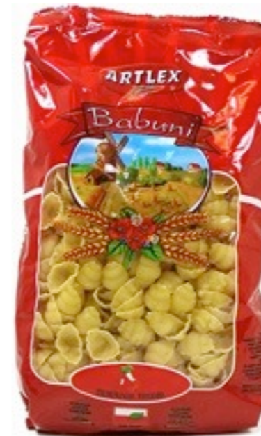
11533. Muszelka 400g (18)