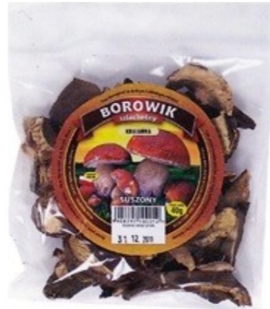
10223.Boletus 20g (50)