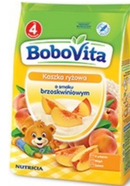
13562.Peach 180g (9)