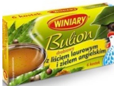
14937.Kurczak/ziele/liść 60g (32)