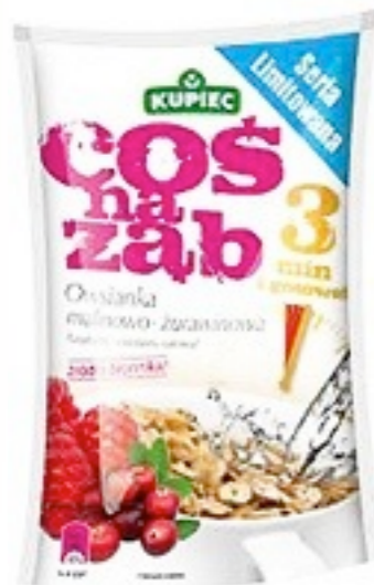
16298. Rasp-cranberry 50g (14)