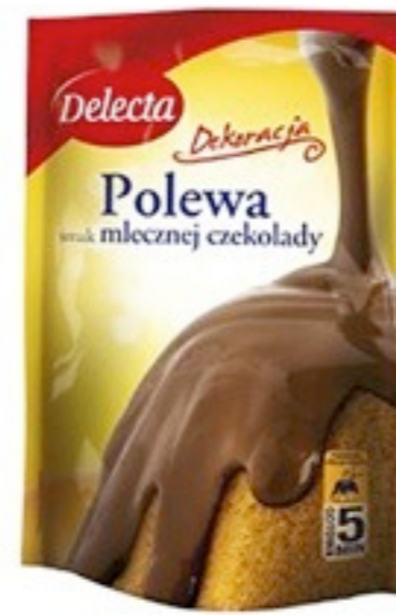
13597. Milk 100g (20)