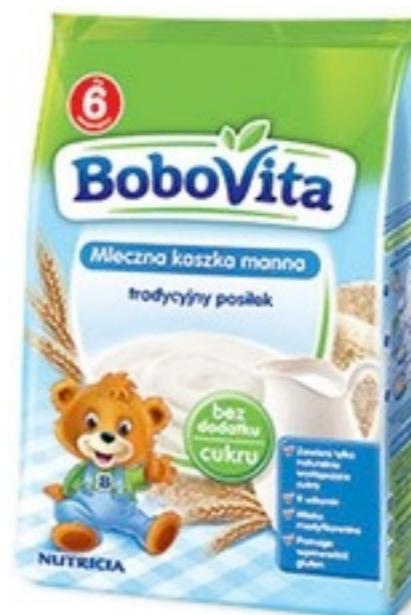
17167.Manna bc 230g (9)