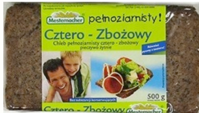
14953. Four grain 500g (12)