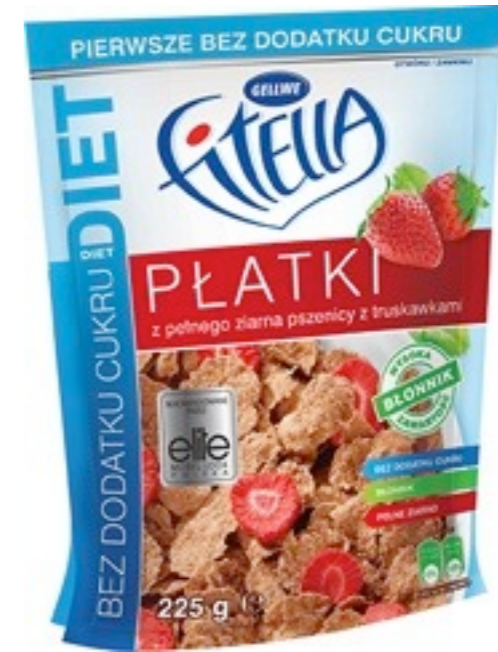
17017. Strawberry no sugar 225g (12)