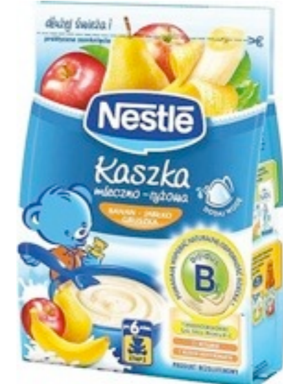
13533.Ban-apple-pear 230g (8)