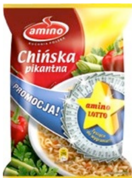
2971. Chinese 61g (24)