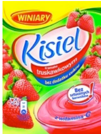
3264.Strawberry bc 38g (30)