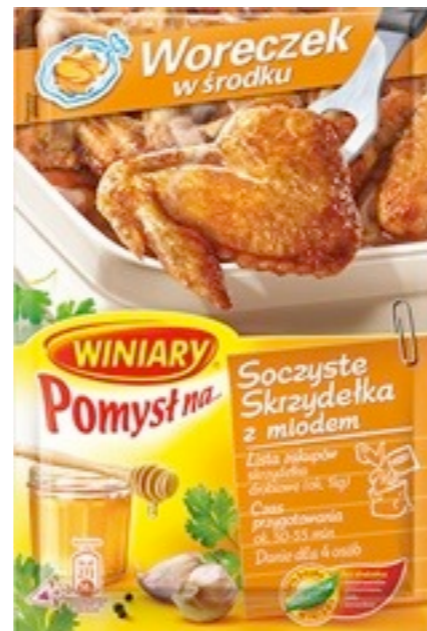
14293. Skrzydełka miód 31g