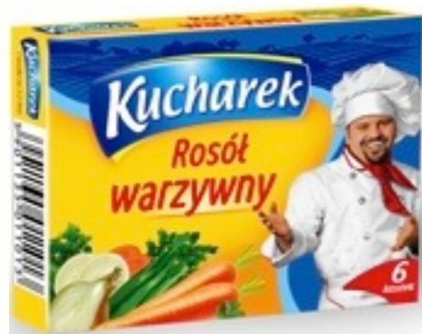
4255.Vegetable 6k (24)