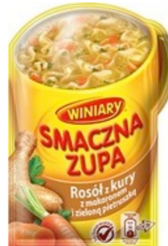
2677. Rosół 14g (20)