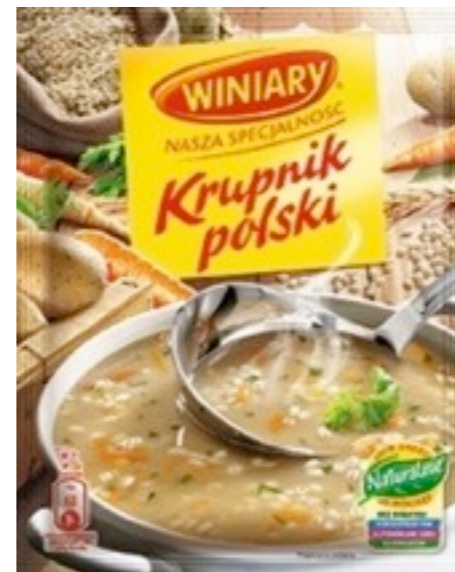
530. Krupnik 59g (20)