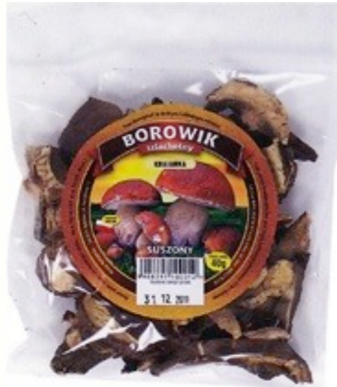
15130.Boletus 40g (25)