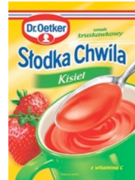
9418. Strawberry 30g (30)