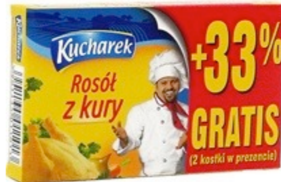
4249.Chicken 6k (24)