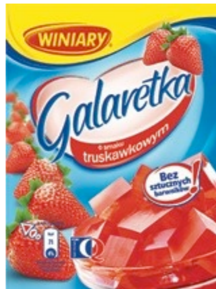
477.Strawberry 75g (22)