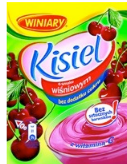
3265.Cherry bc 38g (30)