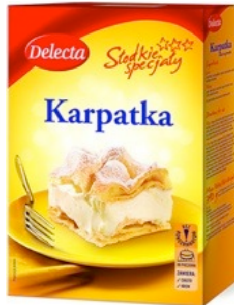
1958. Karpatka 390g (7)