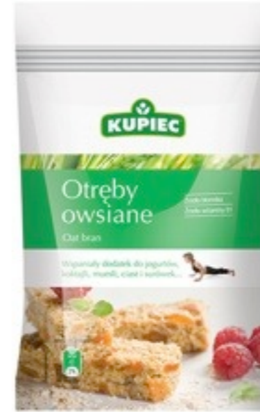
8183. Oat bran 200g (6)