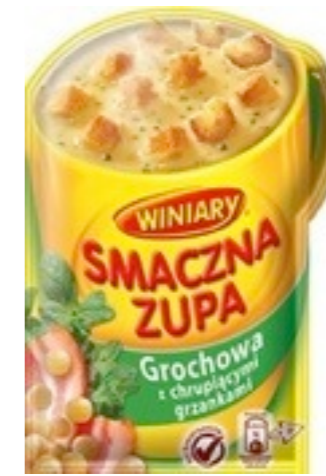
534. Grochowa 21g (28)