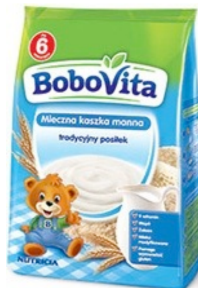
17160.Manna 230g (9)