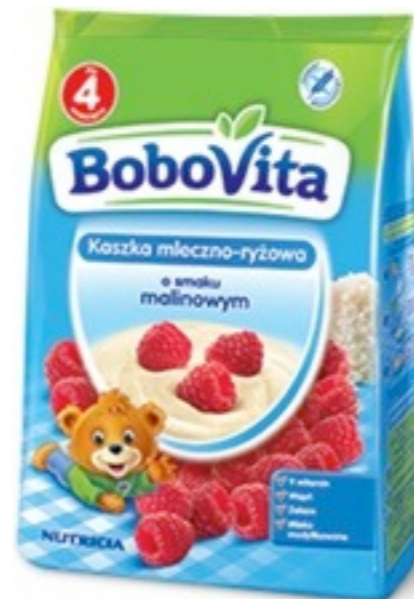
13567.Raspberry 230g (9)