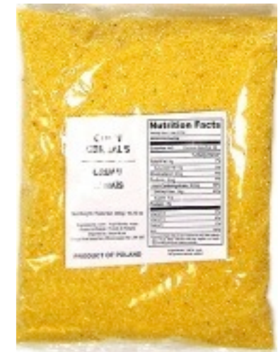
5340. Corn 400g (35)