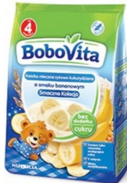
13572.Banan&corn 230g (9)