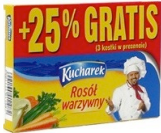
4256.Vegetable 12k (12)