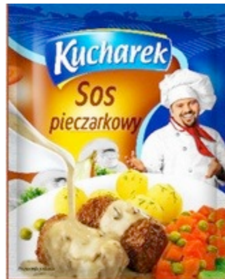
14929.Mushroom 28g (20)