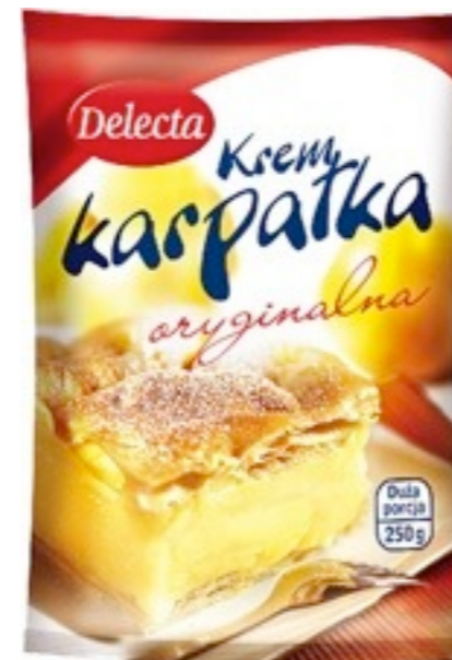
3572. Karpatka krem 250g (12)