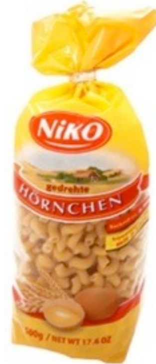
15947. Kolanko 500g (12)