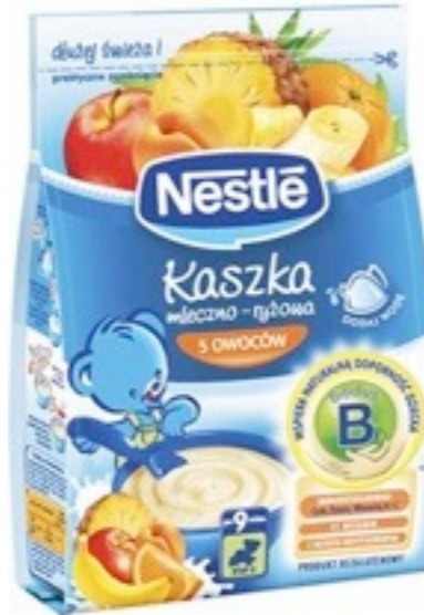
13535.5 Fruits 230g (8)