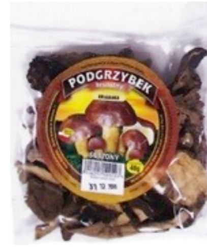
10224.Scaber 20g (50)