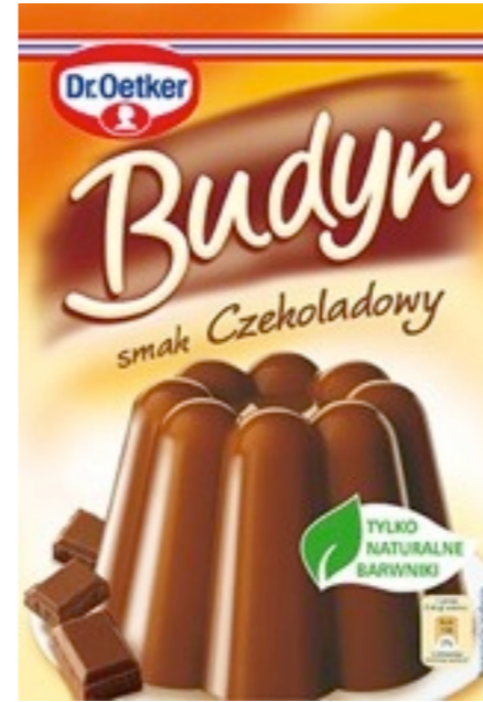
7433. Chocolate 45g (25)