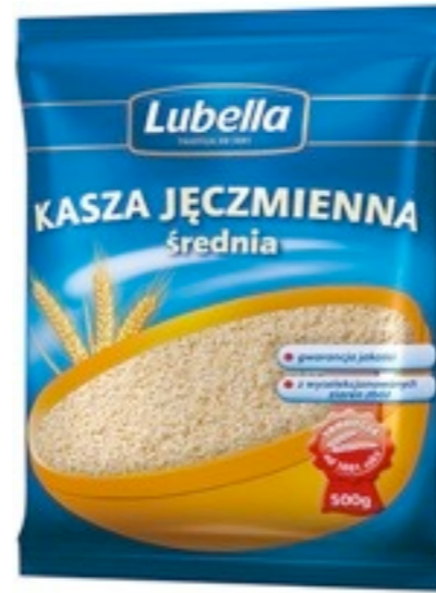
3951. Medium 400g (12)