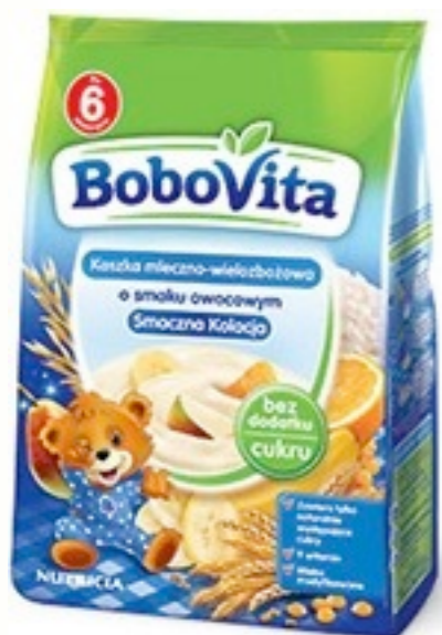
13573.Ovocowa bc 230g (9)