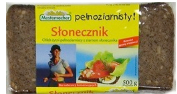
14949. Sunflower 500g (12)