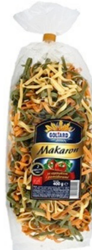
14469. Szpinak&pomidor 400g (8)