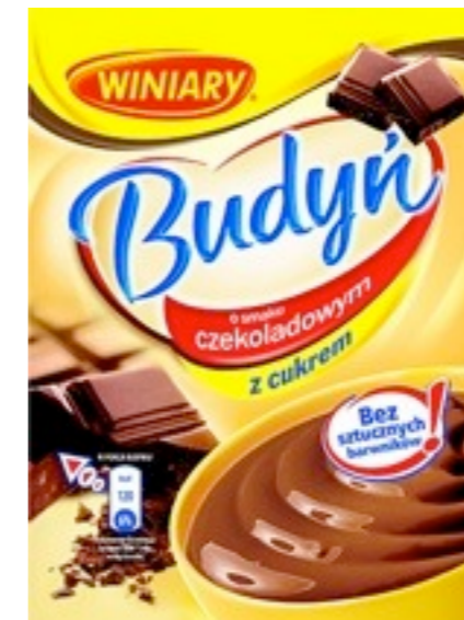
426.Chocolate 63g (25)