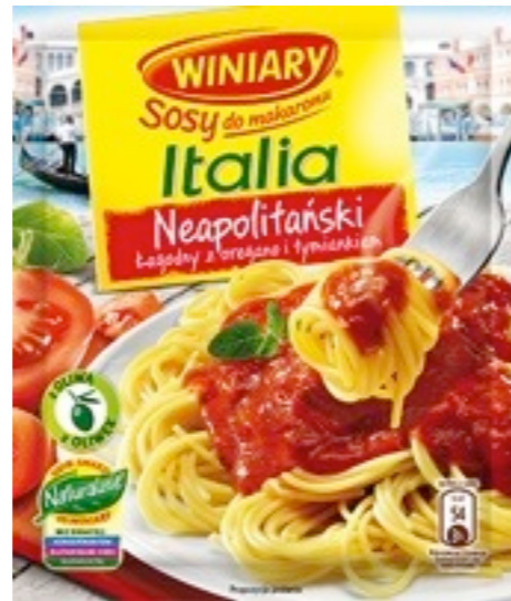
15460. Neapolitański 49g (25)