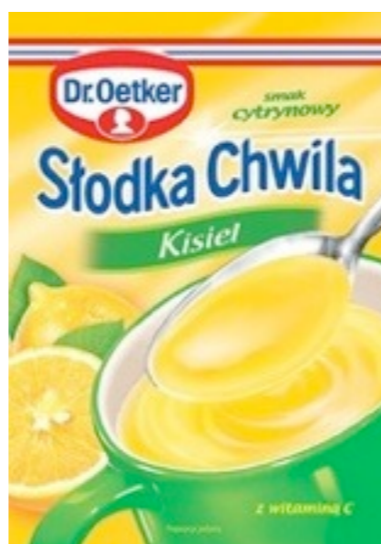
7428. Lemon 30g (30)