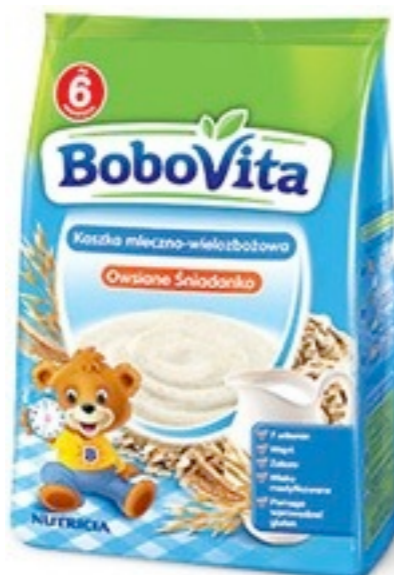
17163.Owsiane śniadanko 230g (9)