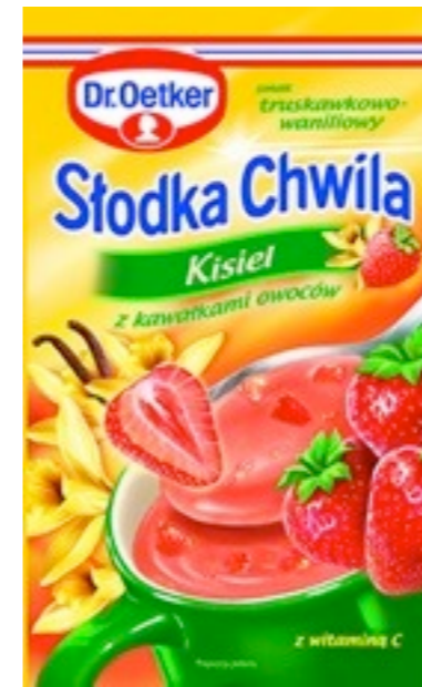
11797. Strawberry-vanilla 32g (30)