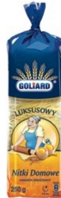
6441. Nitka luksusowa 250g (40)