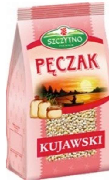
14970. Hulled 400g (12)