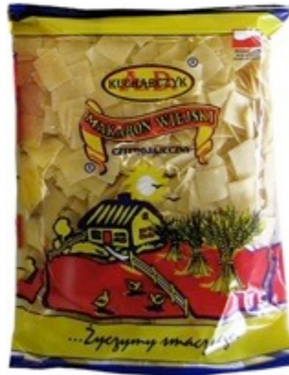
3392. Łazanka duża 250g (30)