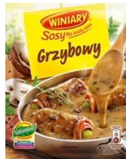
2496. Grzybowy 30g (35)