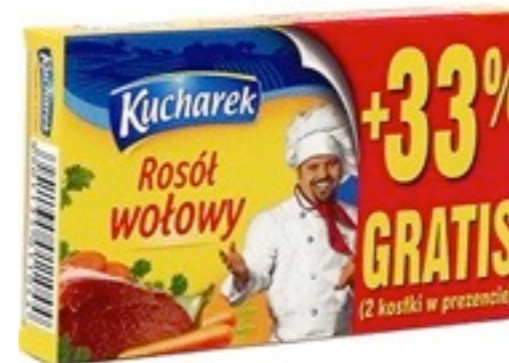
4252.Beef 6k (24)