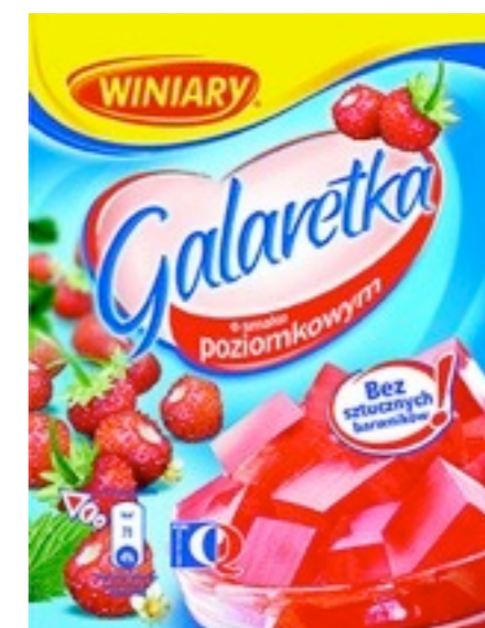
2694.Wild strawberry 75g (22)