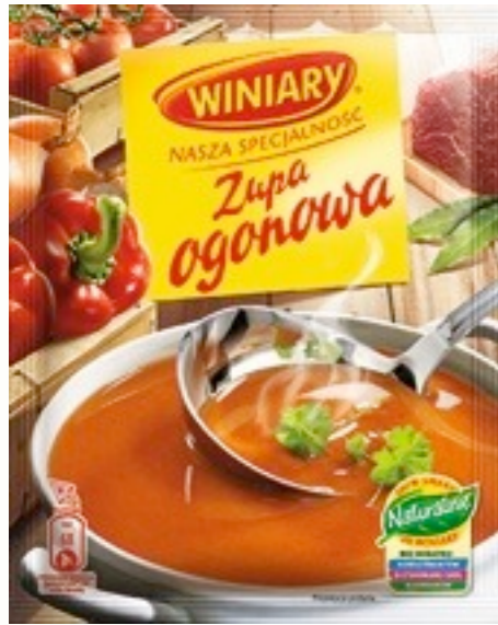
15441. Ogonowa 40g (32)