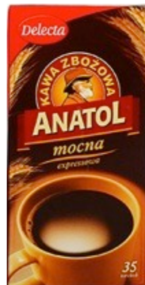
11759. Anatol strong 147g (18)