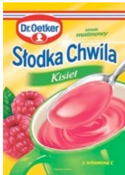
7429. Raspberry 30g (30)