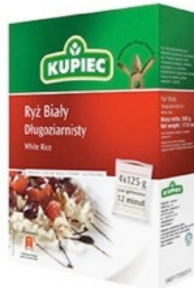
15791. White long 400g (12)