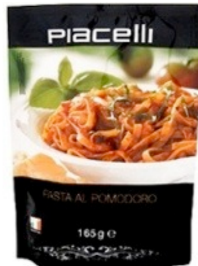
16649. Pasta/tomato sauce 165g (12)