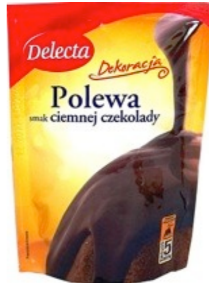
15826. Dark 100g (20)