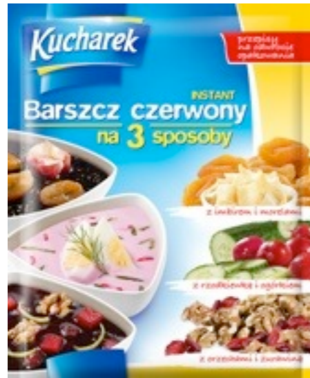
11512.Red borsch 48g (20)