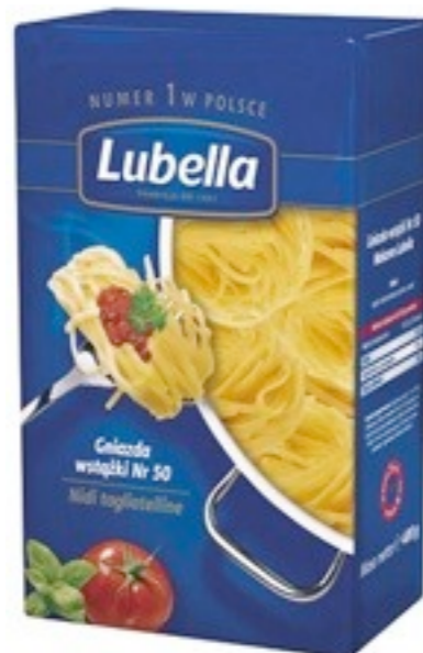
4019. Gniazda wstążki 400g (12)