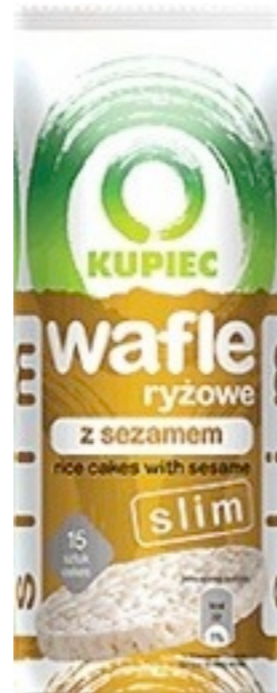
16291. Sesame 90g