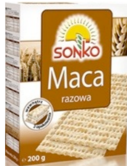
14229. Rye dark 200g (10)