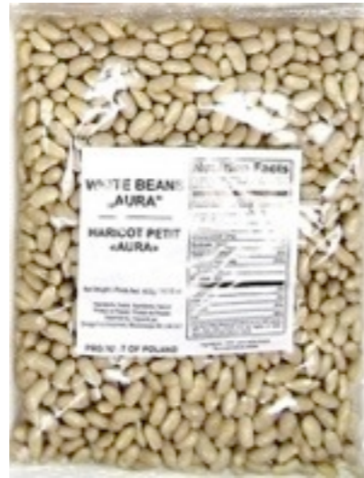
5342. Bean small 400g (35)