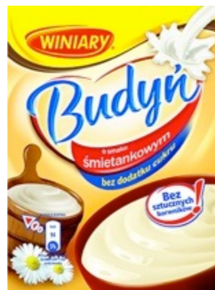
3261.Cream bc 35g (30)