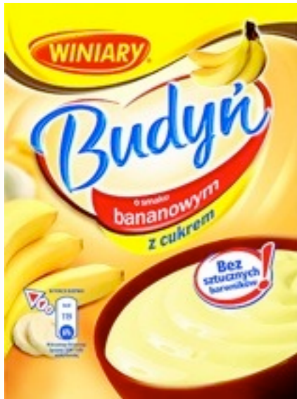
455.Banan 60g (30)