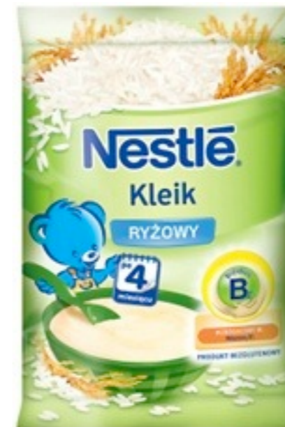
13527. Rice 160g