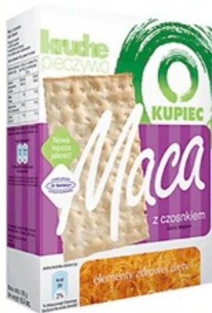
8189. Garlic 180g (10)