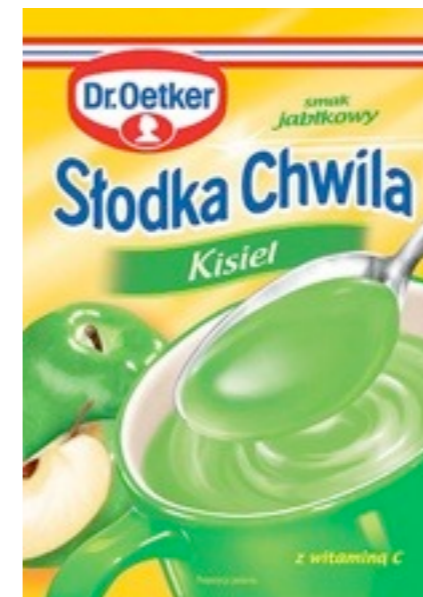
15547. Apple 30g (30)