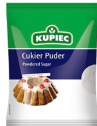
2389. Powder sugar 400g (14)