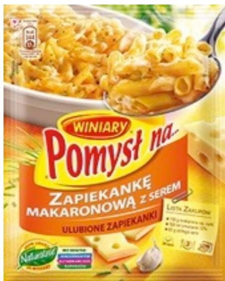
15470. Zapiekanka serowa 47g