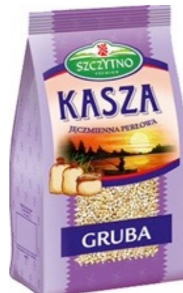
14967. Thick 400g (12)