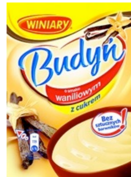
451.Vanilla 60g (30)