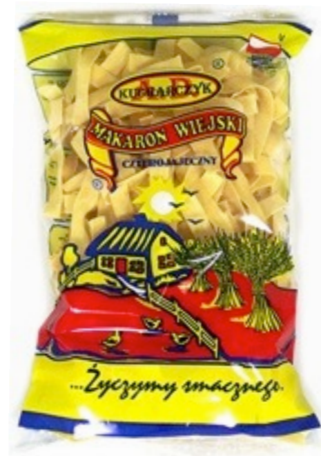
3389. Wstążka 250g (30)