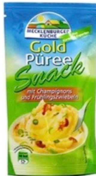
16279. Puree mushroom&onion 10g (10)