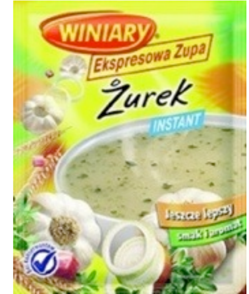
250. Żurek instant 50g (30)