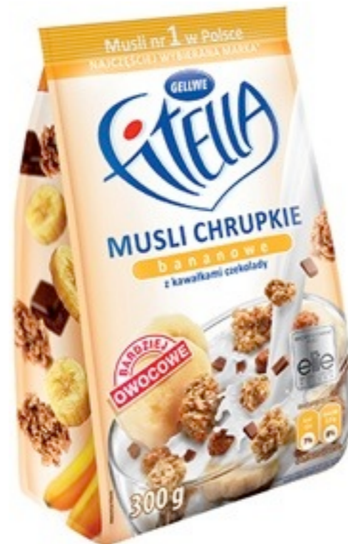
17014. Musli banan 300g (12)