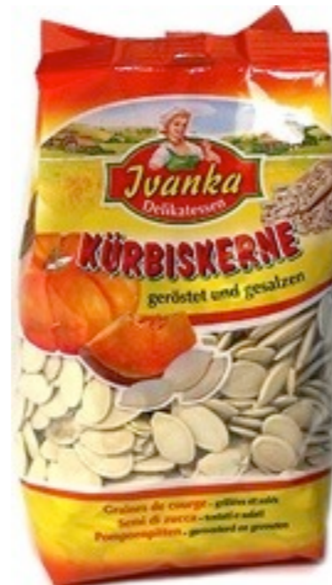
14564. Pumpkin seeds 400g