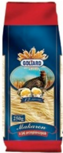
6443. Nitka przepiórcza 250g (10)