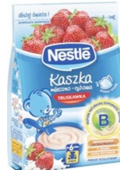
1236.Strawberry 230g (8)