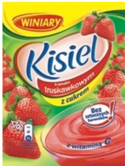
464.Strawberry 77g (25)