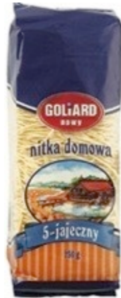
14466. Golard nowy 250g (40)