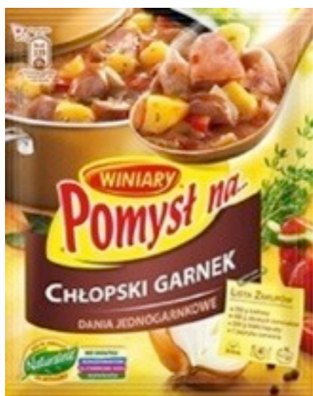
15466. Chłopski garnek 40g (25)