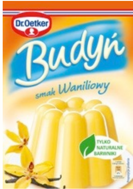
4701. Vanilla 40g (30)