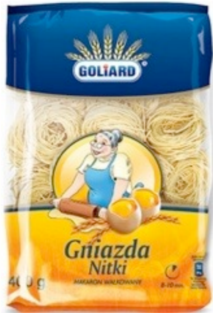
6446. Gniazda nitki 400g (15)