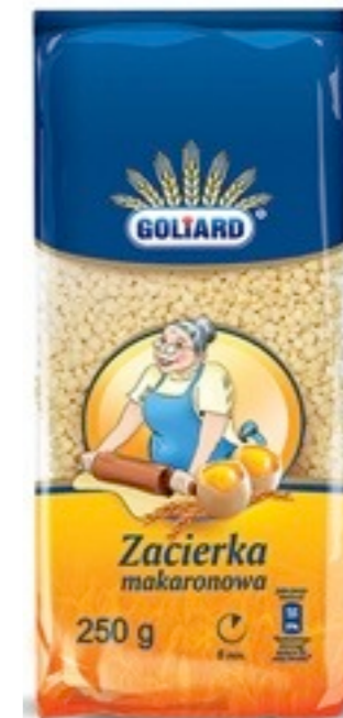
14463. Zacierka 250g (28)