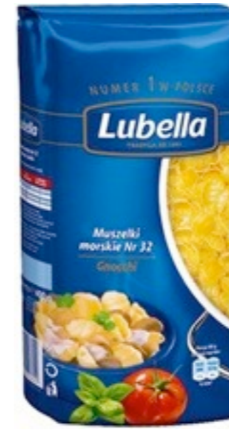
5451. Muszelki 400g (12)