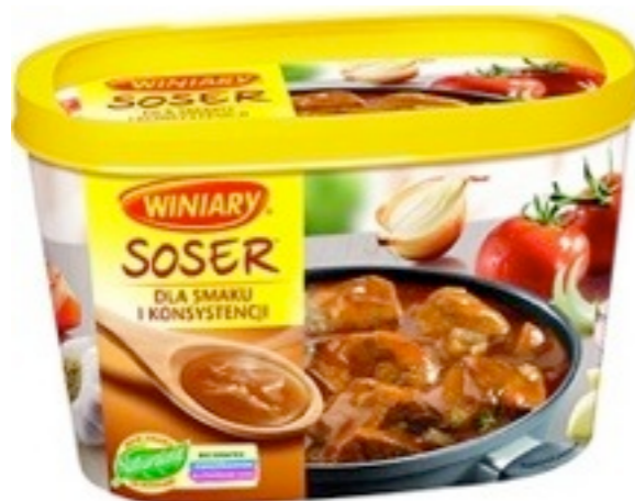
15481.Soser 150g (10)