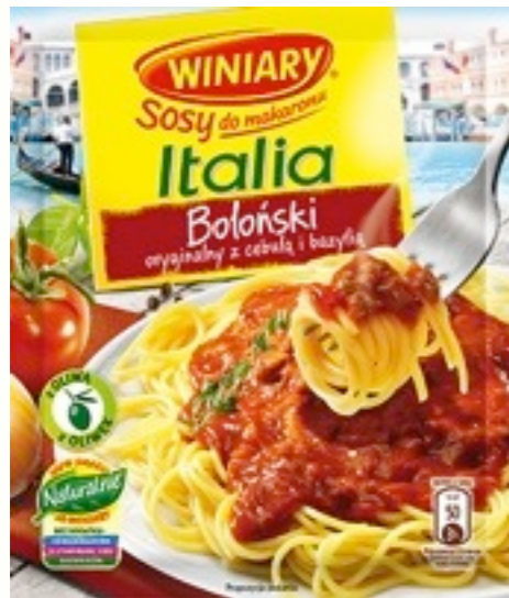
15461. Boloński 46g (25)