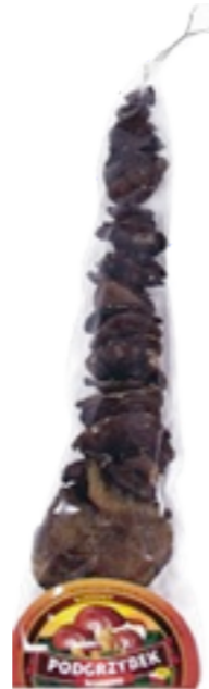
14187.Boletus scaber 50g (1)