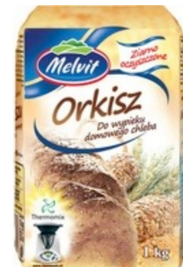
16916. Spelt 1kg (10)