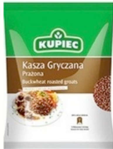
1662. Buckwheat 400g