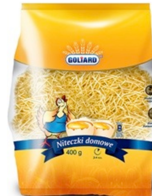
6444. Niteczki domowe 400g (15)