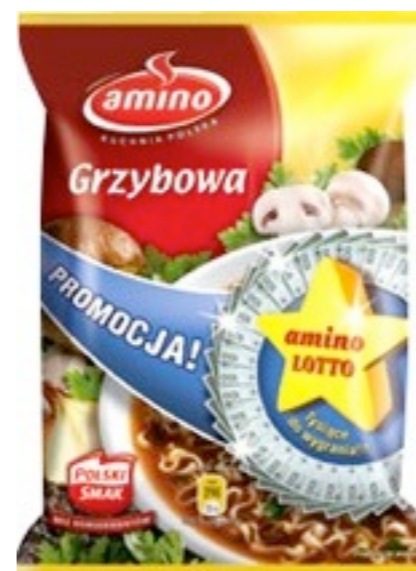
2637. Wild mushroom 60g (24)