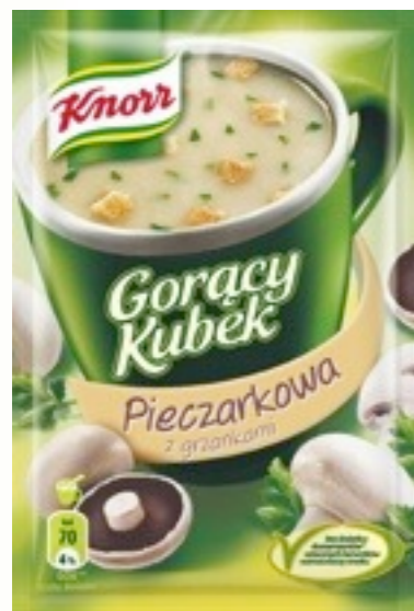
17272.Mushroom 15g (40)