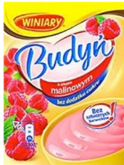
7785.Raspberry bc 35g (30)