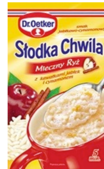
7411. Rice apple 58g