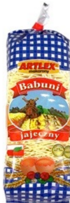
11538. Jajeczny 225g (40)