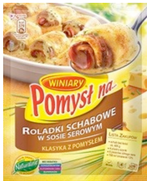
16881. Roladki sch-serowe 30g