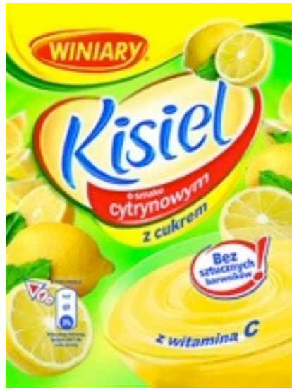
1175.Lemon 77g (25)