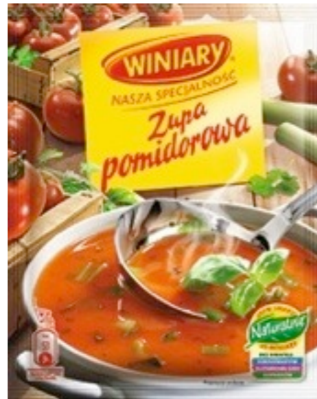
3278. Pomidorowa 50g (28)