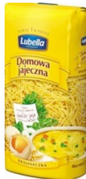
4888. Krajaneczka 250g (18)