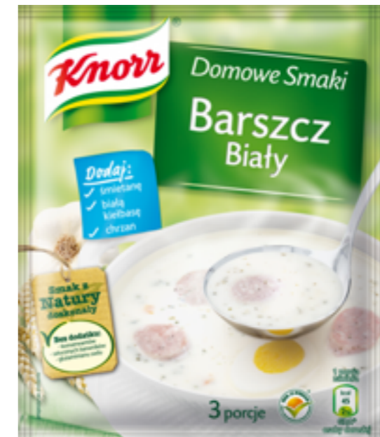
17252.White borsch 36g