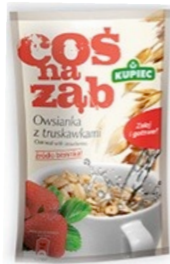
14822. Strawberry 50g (14)