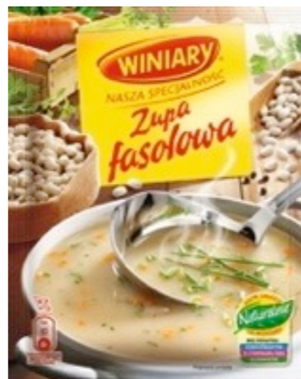
528. Fasolowa 65g (25)