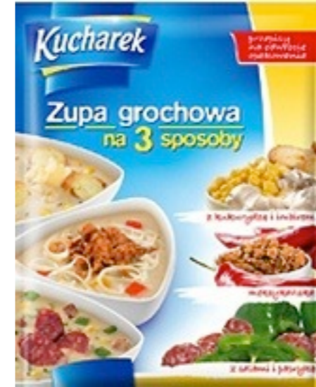
11513.Pea soup 45g (20)