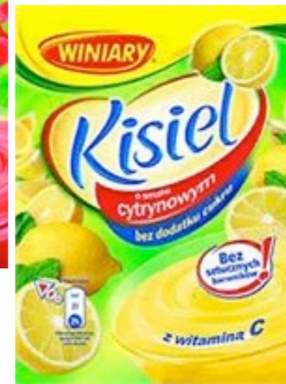
3263.Lemon bc 38g (30)