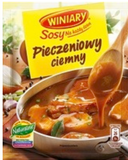
1909.Ciemny 30g (35)