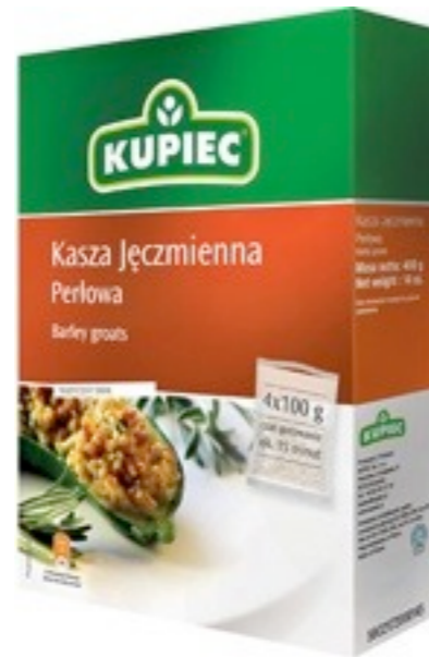
1663. Barley 4x100g