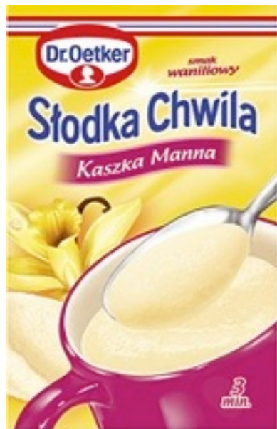
10061. Vanilla 49g