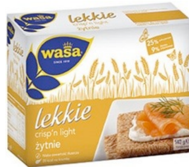
2398. Rye light 140g (10)