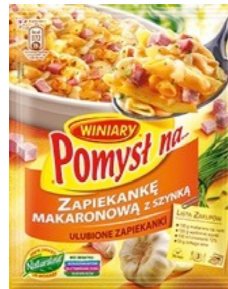
15473. Zap. szynka 35g