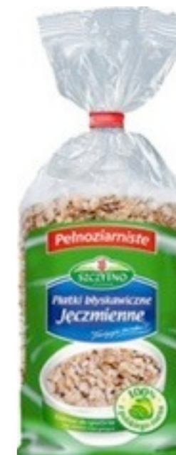
14979. Barley 400g