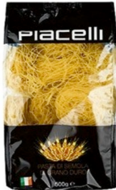
16652. Gniazda nitki 500g (8)