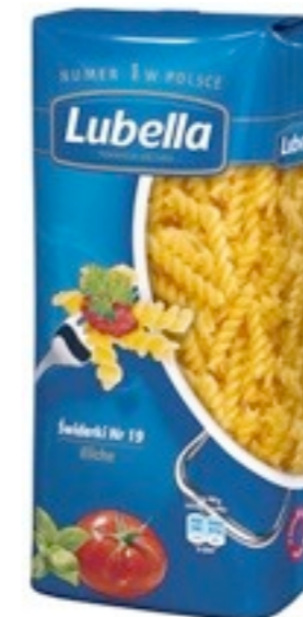
5450. Świderki 400g (12)