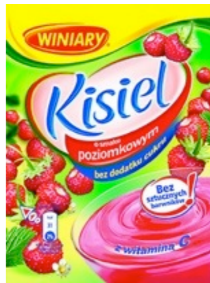
7739.Wild strawberry bc 38g (30)