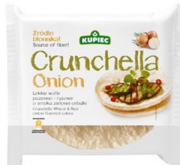
16296. Rice-wheat w/onion 56g