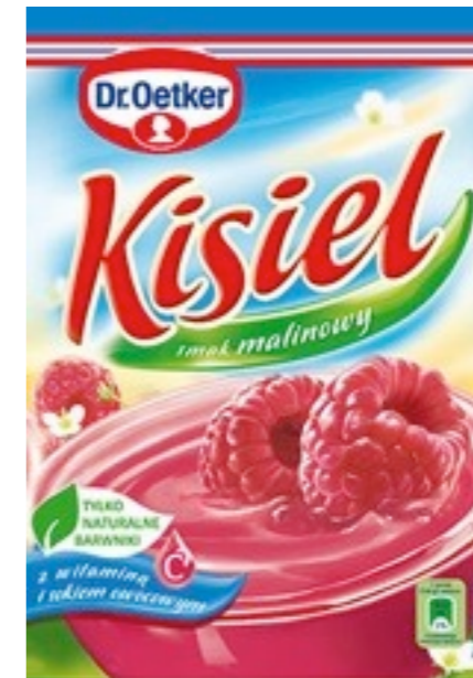
7430. Raspberry 38g