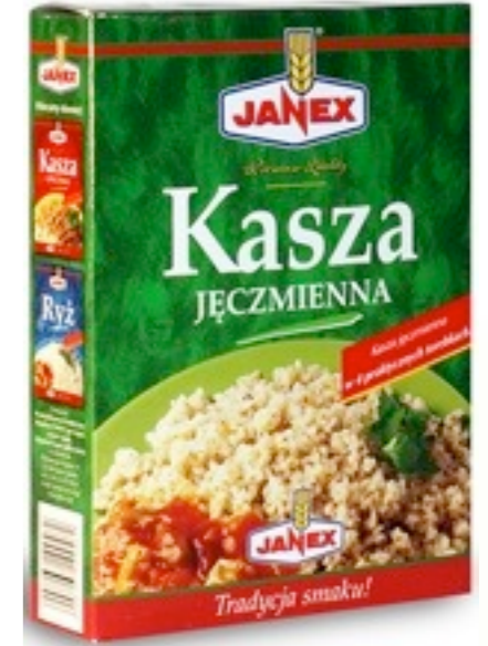
11074. Barley 4x100g (20)