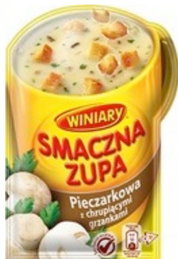
539. Pieczarkowa 16g (28)