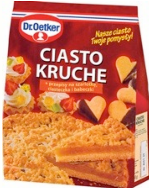
11782. Kruche 400g (8)