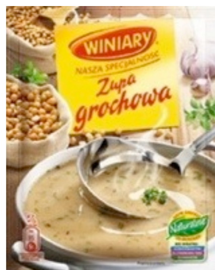
518. Grochowa 75g (25)