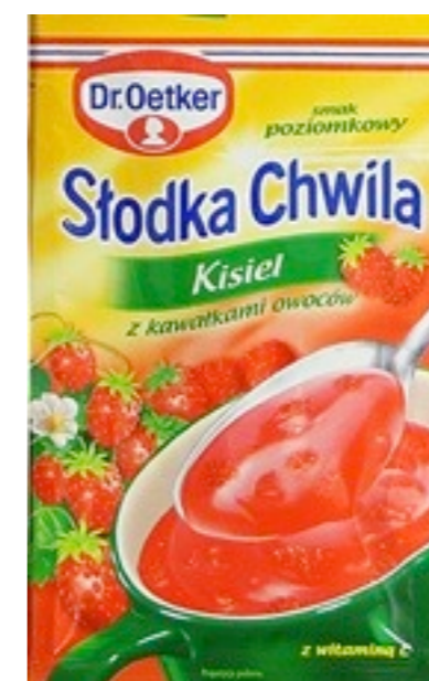
11796. Wild strawberry 32g (30)