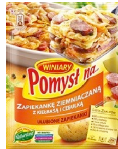
15476. Zap. kiełbasa 41g