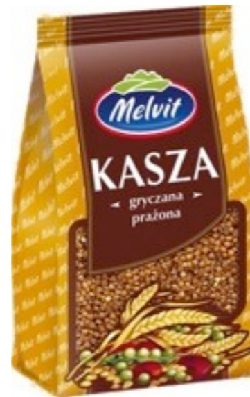
15909. Buckwheat 400g (12)