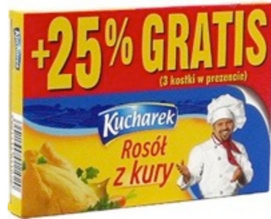
4250.Chicken 12k (12)