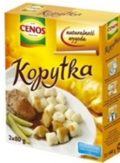
16744. Dumplings 2x80g