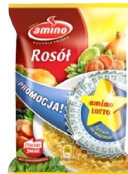
1653. Chicken 60g (24)