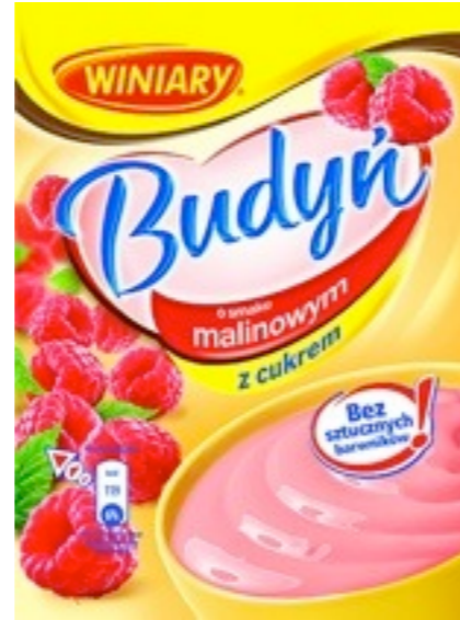
454.Raspberry 60g (30)