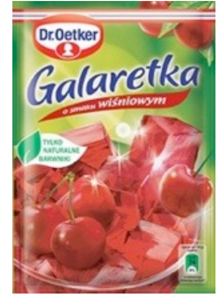
7427. Cherry 75g (20)