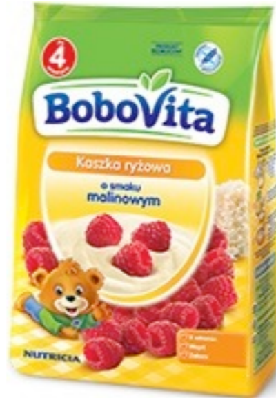
13560.Raspberry 180g (9)