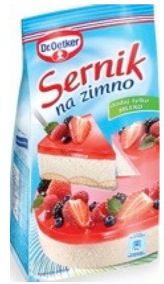
444. Cheesecake 193g (8)