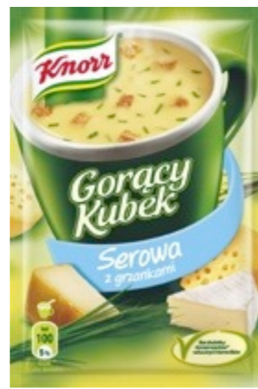
17267.Cheese 19g (36)