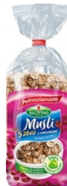
14976. Musli 5 grains 400g