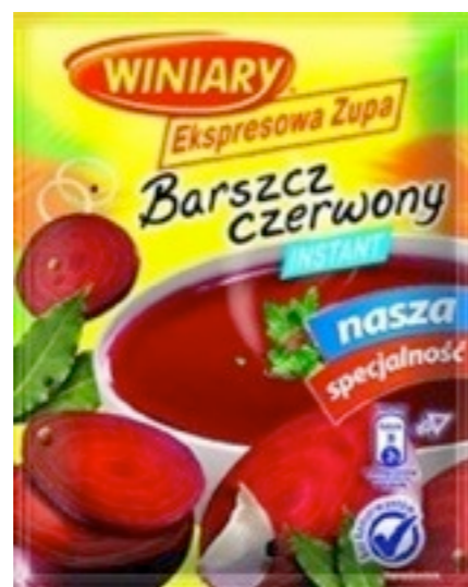
1156. Czerwony instant 55g (30)