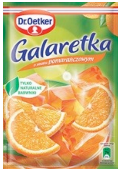
7424. Orange 75g (20)