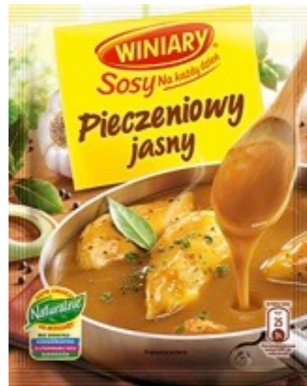
2823.Jasny 27g (35)