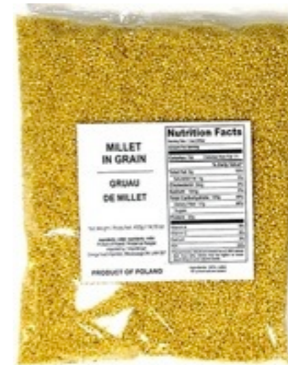
5339. Millet 400g (40)