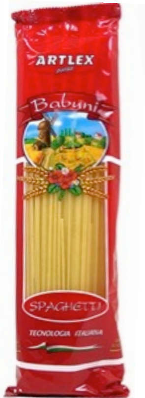
14602. Spaghetti 400g (24)