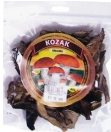
15131.Leccinum 40g (25)