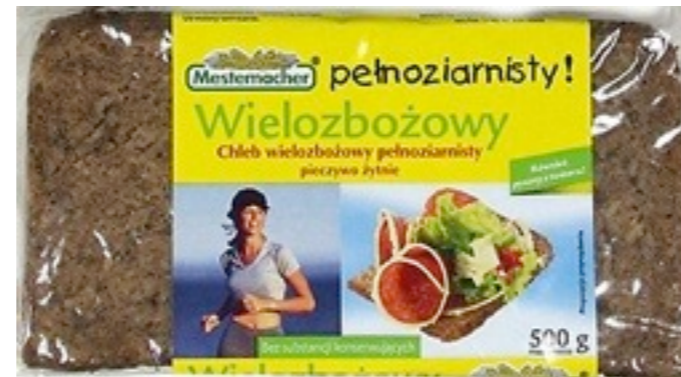
14948. Multigrain 500g (12)