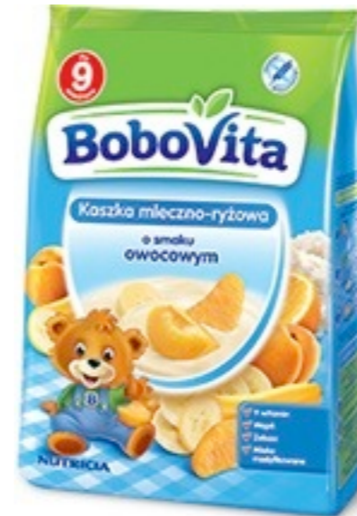
13570.Multifruit 230g (9)