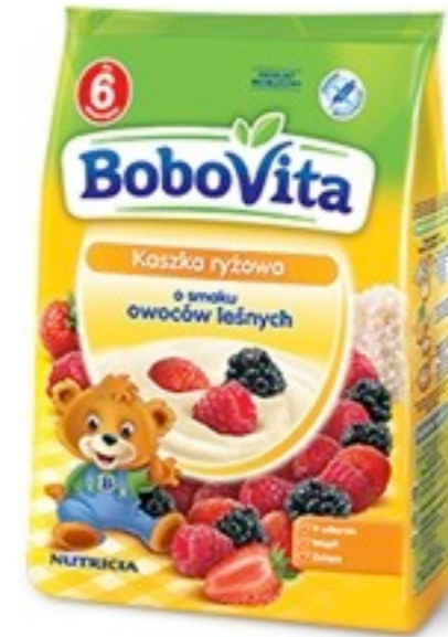
13563.Forrest 180g (9)