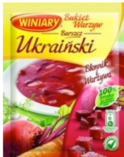
15445. Ukraiński 54g (24)