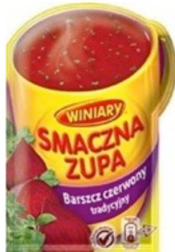
538. Barszcz czerwony 13g (40)