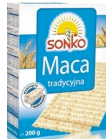
14226. Traditional 200g (10)