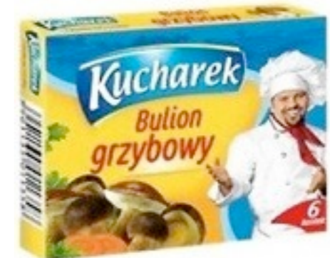
4547.Mushroom 6k (24)