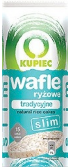
16293. Plain SLIM 90g