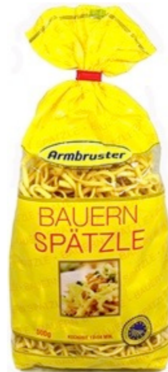
17098. Bauern 500g (10)