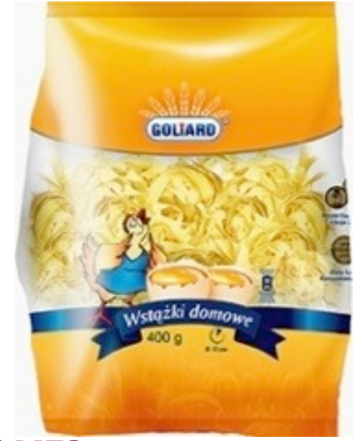
14472. Wstążki domowe 400g (15)