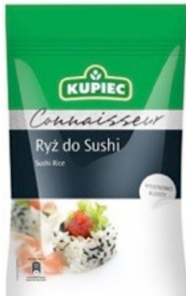
15789. Sushi rice 400g (6)