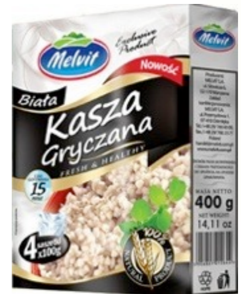
15907. White 4x100g (10)