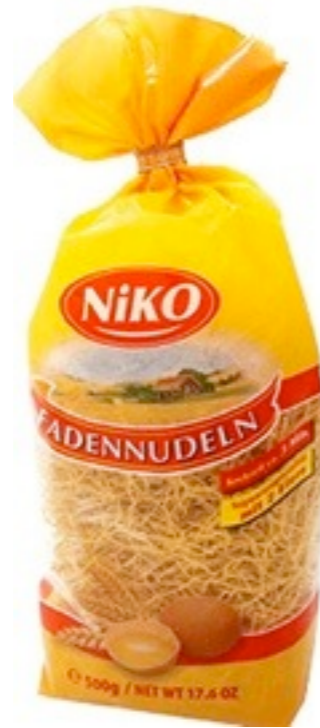
15911. Nitka 500g (10)