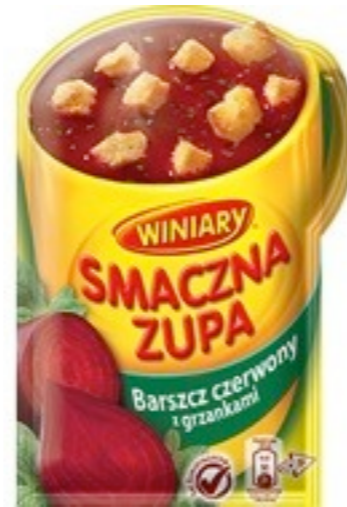
708. Czerwony/grzanki 16g (28)