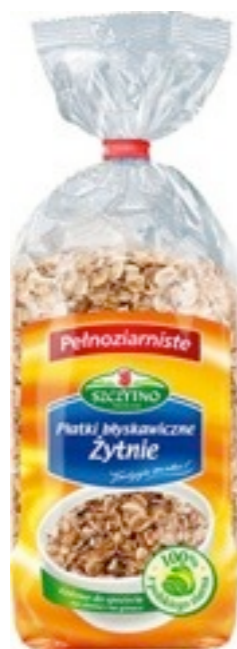
14980. Rye 400g