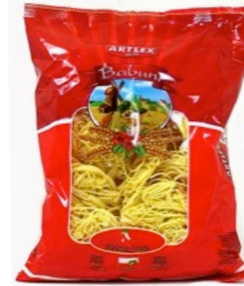
11536. Gniazda nitka 400g (10)