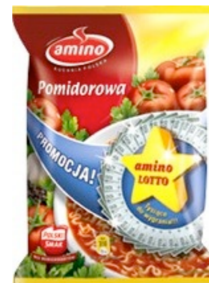
13526. Tomato 64g (24)