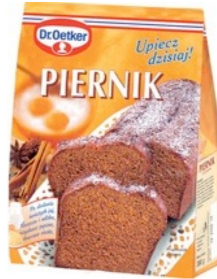
432. Gingerbread 380g (8)