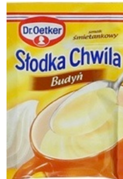
4702. Cream 45g (30)