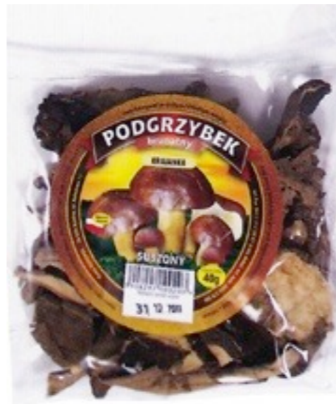
15129.Scaber 40g (25)