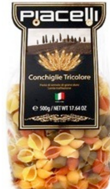
16653. Conchiglie 3-color 500g (16)