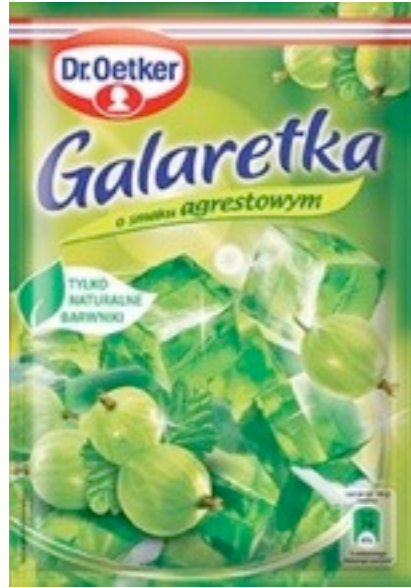
7422. Gooseberry 75g (20)