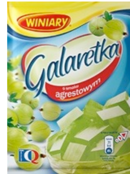
2692.Gooseberry 75g (22)