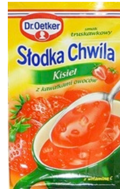
486. Strawberry 32g (30)