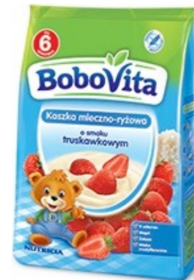
13569.Strawberry 230g (9)