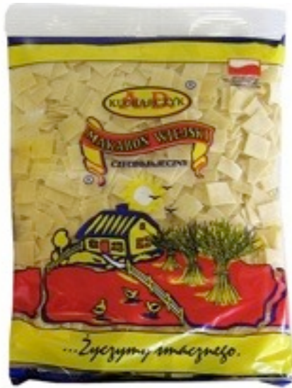
4277. Łazanka mała 250g (30)