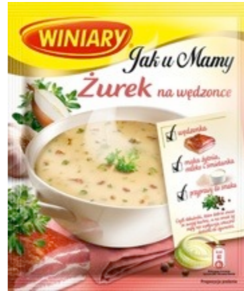
15444. Żurek na wędzonce 44g (30)