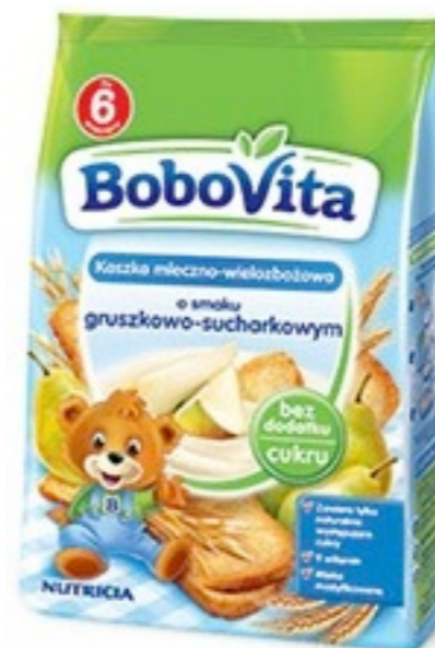
17168.Gruszka-sucharki 230g (9)