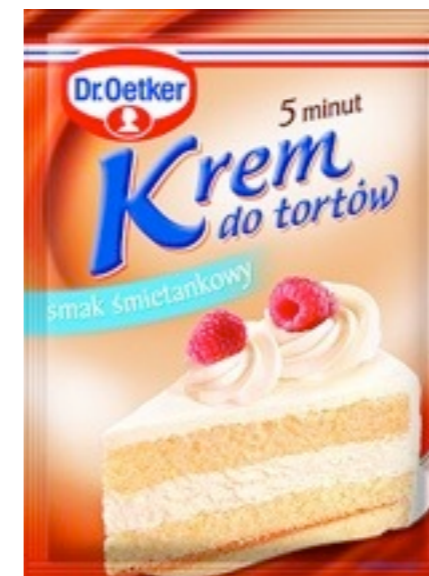
11775. Cream 120g (20)