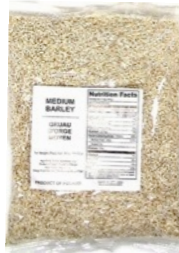
5336. Medium 400g (30)