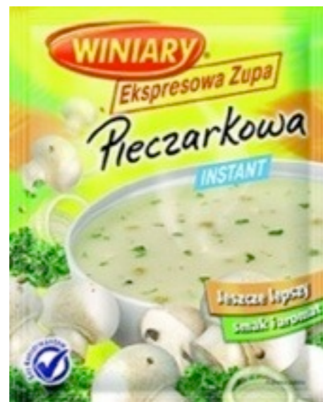
540. Pieczarkowa instant 60g (28)