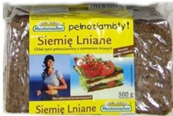
14951. Rye/flaxseed 500g (12)