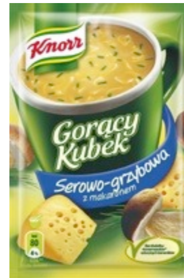
17270.Cheese-mushroom 17g (36)