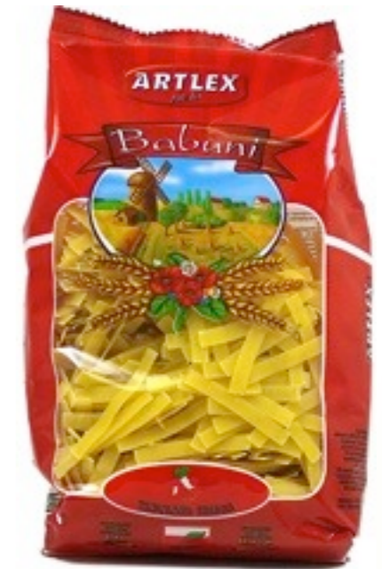
14600. Wstążka gruba 400g (18)