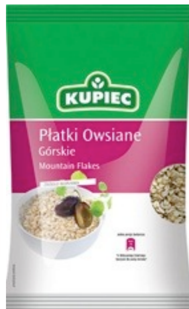
1148. Mountain oats 400g (16)