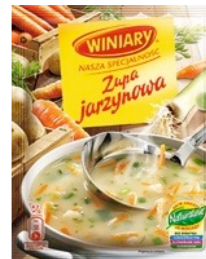
3090. Jarzynowa 48g (25)