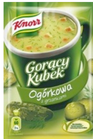
17273.Cucumber 14g (40)