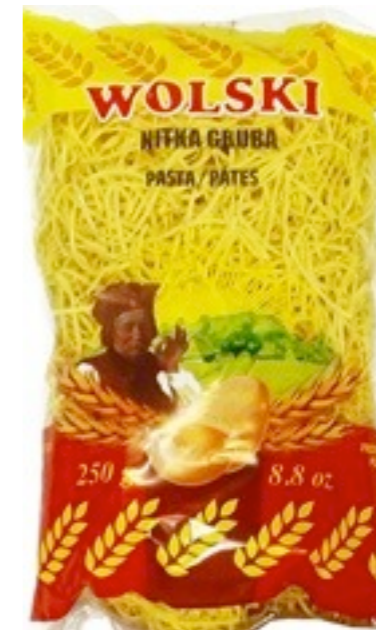
3391. Nitka gruba 250g (30)