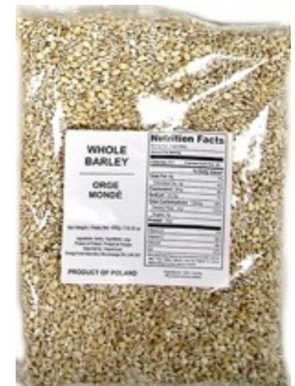
5334. Whole barley 400g (30)