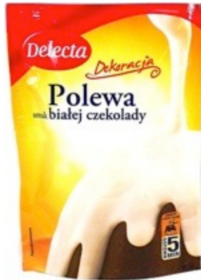
13598. White 100g (20)