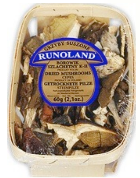
5486.Boletus 60g (10)