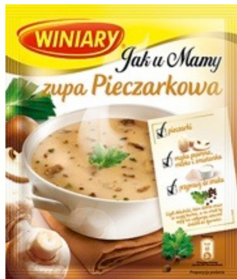
529. Pieczarkowa 45g (25)