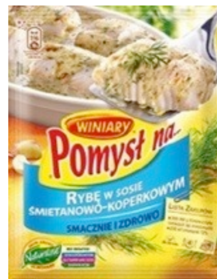
12962. Ryba 32g (20)