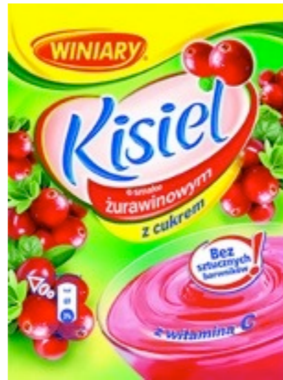
466.Cranberry 77g (25)