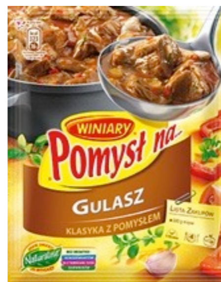
1235. Gulasz 47g