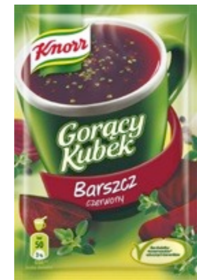
17271.Red borsch 12g (40)