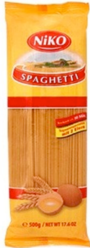
15982. Spaghetti 500g (10)