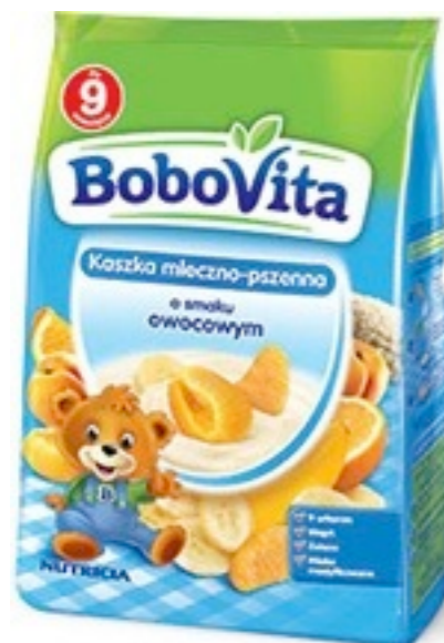
17161.Pszenna owocowa 230g (9)