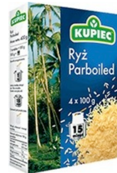
16303. Parboiled 400g (6)