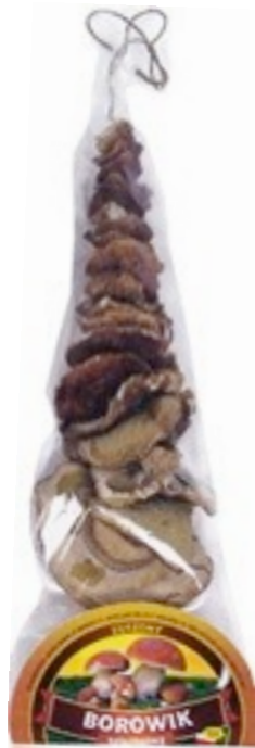
14186.Boletus 50g (1)