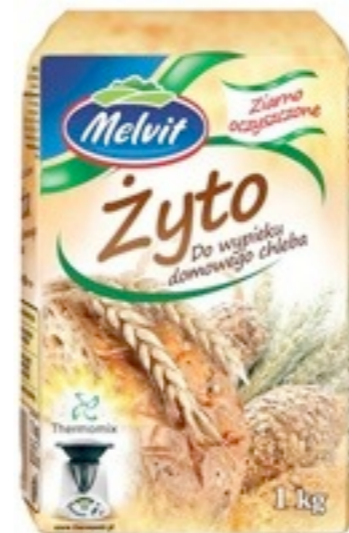
16917. Rye grain 1kg (10)