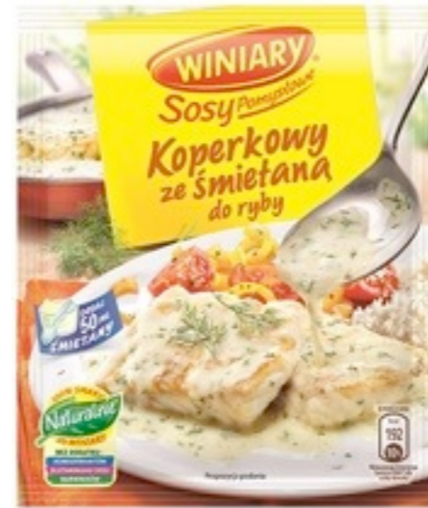
15451.Koperkowy/ryba 30g (35)